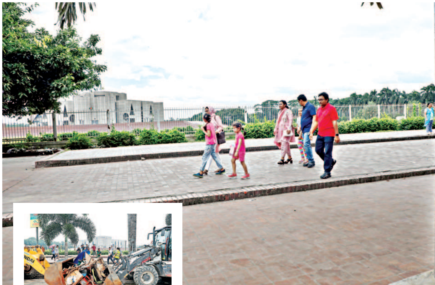
Pedestrians walk freely along the footpath in front of the Sangsad Bhaban in Dhaka yesterday, a day after city corporation authorities evicted street vendors, inset.