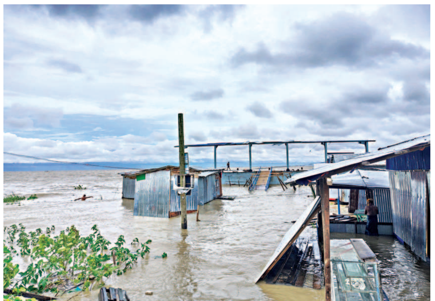
The Ilisha launch terminal in Bhola remains submerged due to tidal surges triggered by a low-pressure system over the Bay of Bengal, disrupting operations and causing immense suffering to passengers -- particularly those arriving from Dhaka. The photo was taken yesterday.