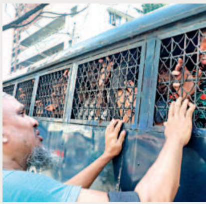
A man reaching out to speak to a detainee inside a prison van at the CMM court in Dhaka on July 25, 2024, amid mass arrests during the uprising.