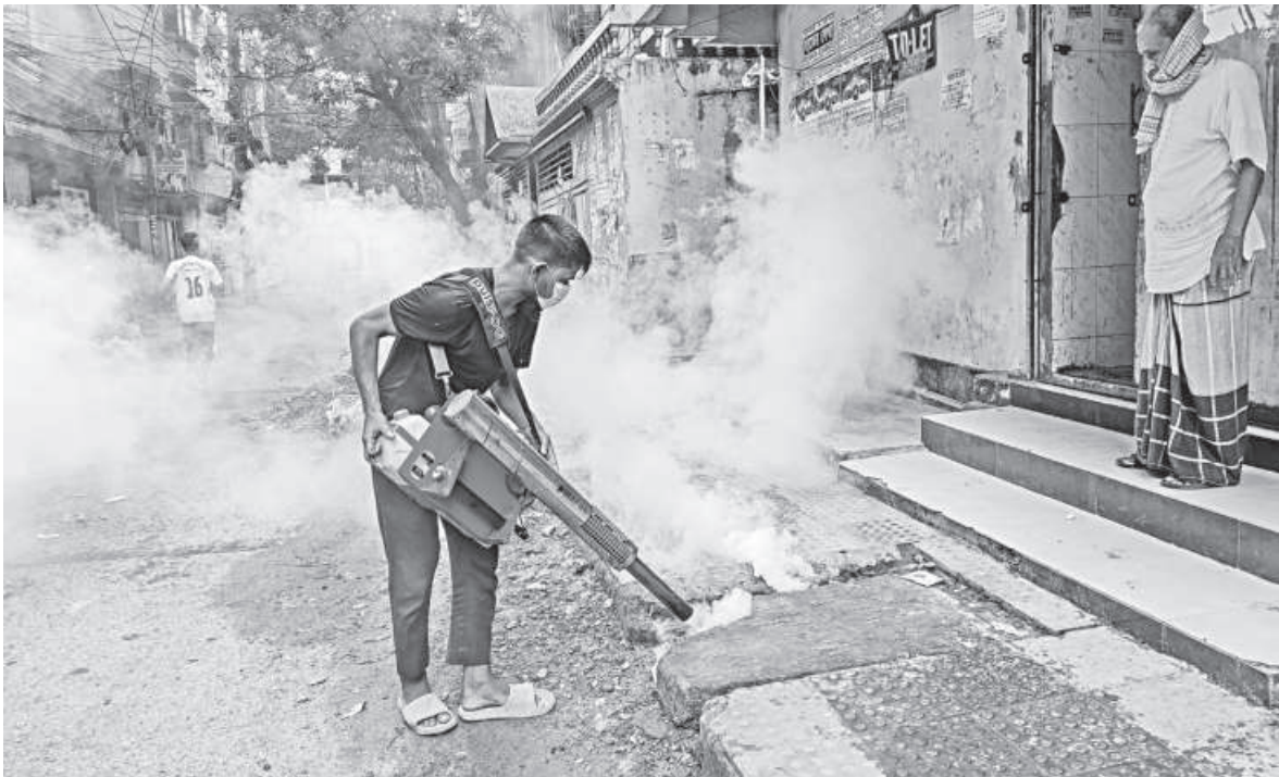
A Dhaka North City Corporation worker sprays pesticide in the Ring Road area of Mohammadpur in the capital yesterday, with the goal to curb the spread of dengue. Efforts have been ramped up, following rising number of dengue infections across the country.