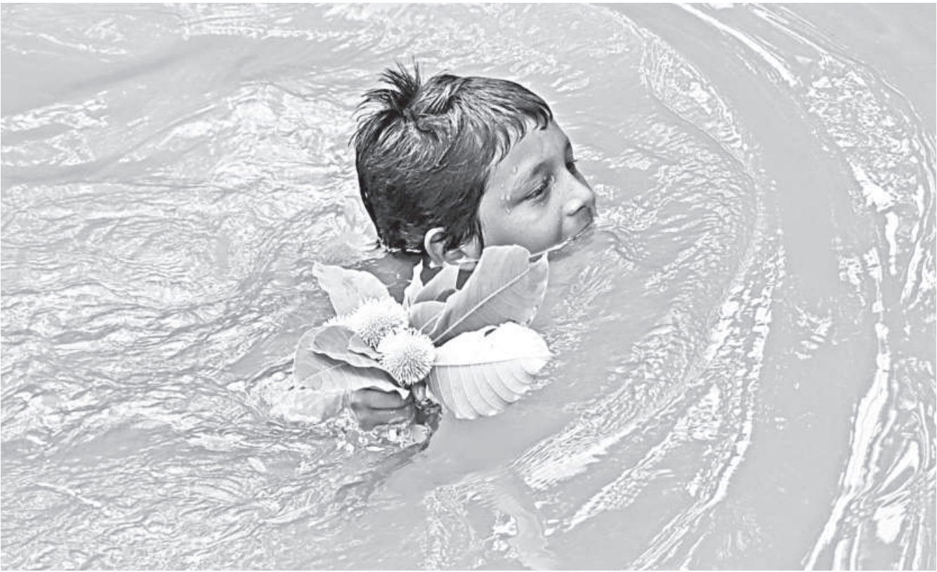
A child swims home through the village canal, clutching freshly plucked kadam flowers. His face lights up with the happiness of a successful little adventure. The photo was taken in Jhalakathi recently.

As of May, a total of 299,643 commercial vehicles were registered with the BRTA, including 85,198 buses and minibuses and 214,445 trucks, covered vans, and tankers.