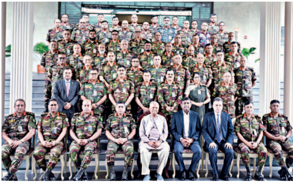
Chief Adviser Prof Muhammad Yunus at the inauguration the "Army Headquarters Selection Board-2025" at the Dhaka cantonment yesterday. Upon his arrival, the chief adviser was welcomed by Chief of Army Staff General Waker-Uz-Zaman.