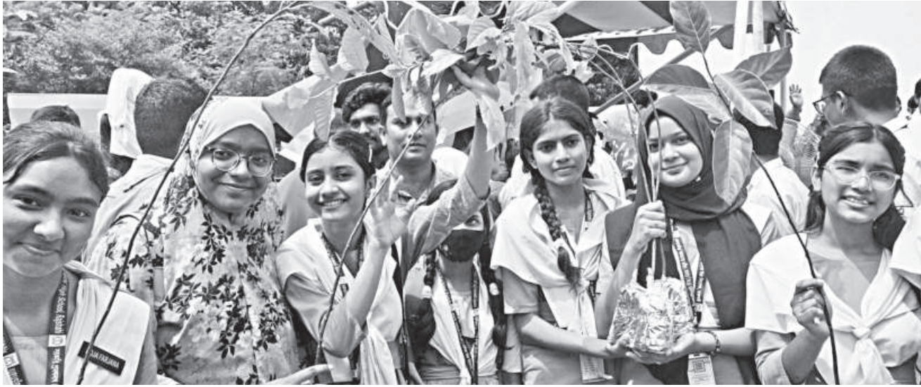
A tree plantation campaign titled “One Martyr, One Tree” was held across the country yesterday, in memory of those who sacrificed their lives during the July uprising. The photo was taken in Rajshahi.