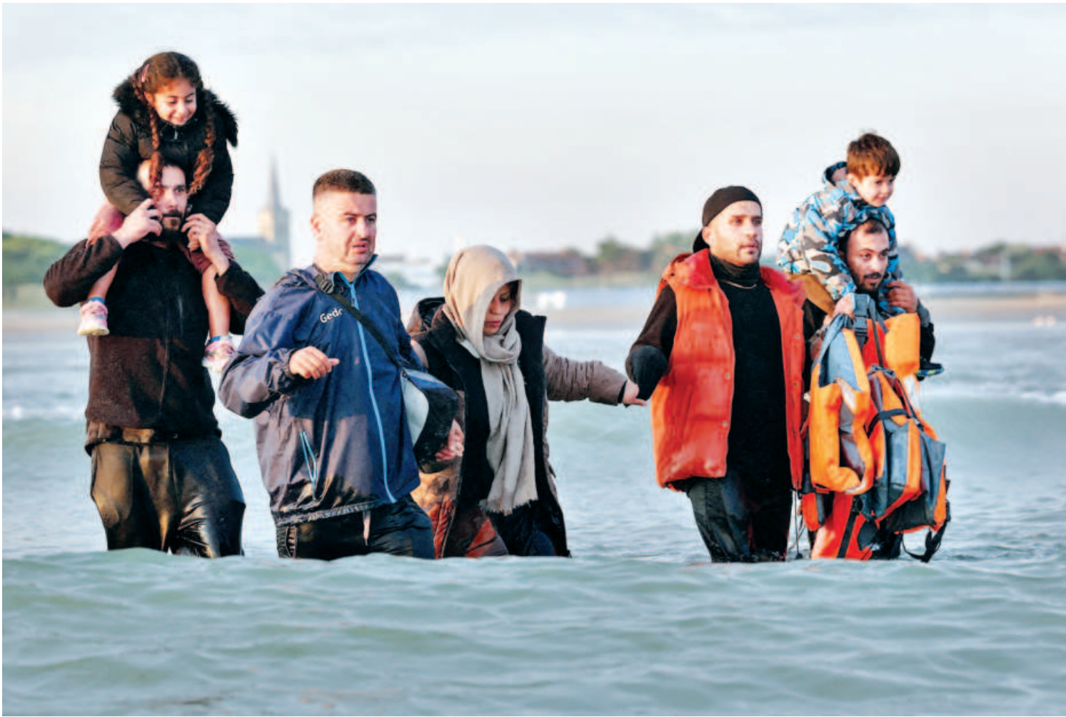
A group of migrants walk into the water to board an inflatable dinghy in an attempt to cross the English Channel to Britain, as tougher migration controls are announced, at Petit-Fort-Philippe beach in Gravelines, near Calais, France, yesterday.

AFP, Kut A fire tore through a newly opened shopping mall in the eastern Iraqi city of Kut overnight, killing at least 69 people, authorities said yesterday, as grief-stricken families searched for missing relatives. Officials said many people suffocated in bathrooms, while one person told AFP that his five relatives died in an elevator. At least 11 people remained missing. The blaze – the latest in a country where safety regulations are frequently neglected – broke out late Wednesday, reportedly starting on the first floor before rapidly engulfing the five-storey Corniche Hypermarket Mall. The cause was not immediately known, but one survivor told AFP an air conditioner had exploded. Several people told AFP they lost families including mothers and children who had gone to shop and dine