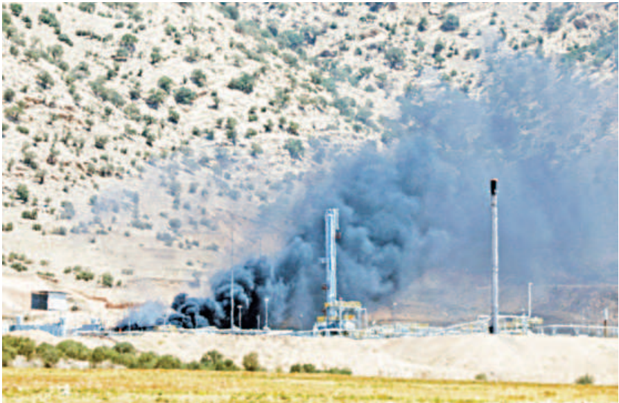
Smoke rises after a drone attack targeted oil facilities in the Zakho area of Iraq’s Kurdistan region yesterday. Kurdish authorities said explosive-laden drones struck three oil fields in the autonomous region.