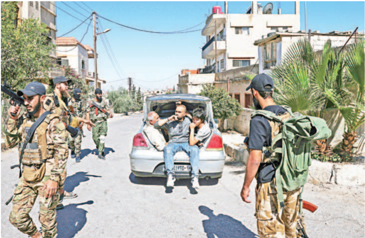
Syrian security forces deploy as residents flee their homes amid ongoing clashes in the southern Sweida city yesterday. Damascus deployed troops in the predominantly Druze province of Sweida, after clashes between Druze fighters and Bedouin tribes killed scores of people.

around the southern city of Sweida, pitting fighters from the Druze minority against government security forces and members of Bedouin tribes, prompting Israel to strike repeatedly with the declared aim of protecting the Druze. The Syrian Network for Human Rights reported that 169 people had been killed in this week’s violence. Security sources put the toll at 300. “We are surrounded and we hear the fighters screaming ... we’re so scared,” said a resident of Sweida, a predominantly Druze city, who was reached by phone. The crack of gunfire interspersed by booms could be heard in the background. “We’re trying to keep the children quiet so that no one can hear us,” the man added, asking not to be identified for fear of reprisals. The violence has underlined big challenges facing interim President Ahmed al-Sharaa despite warming ties with the US, as he seeks to stitch Syria back together in the face of deep misgivings from groups that reject Islamist rule. Syrian government troops were dispatched to the Sweida region on Monday to quell fighting between Druze fighters and Bedouin armed men.