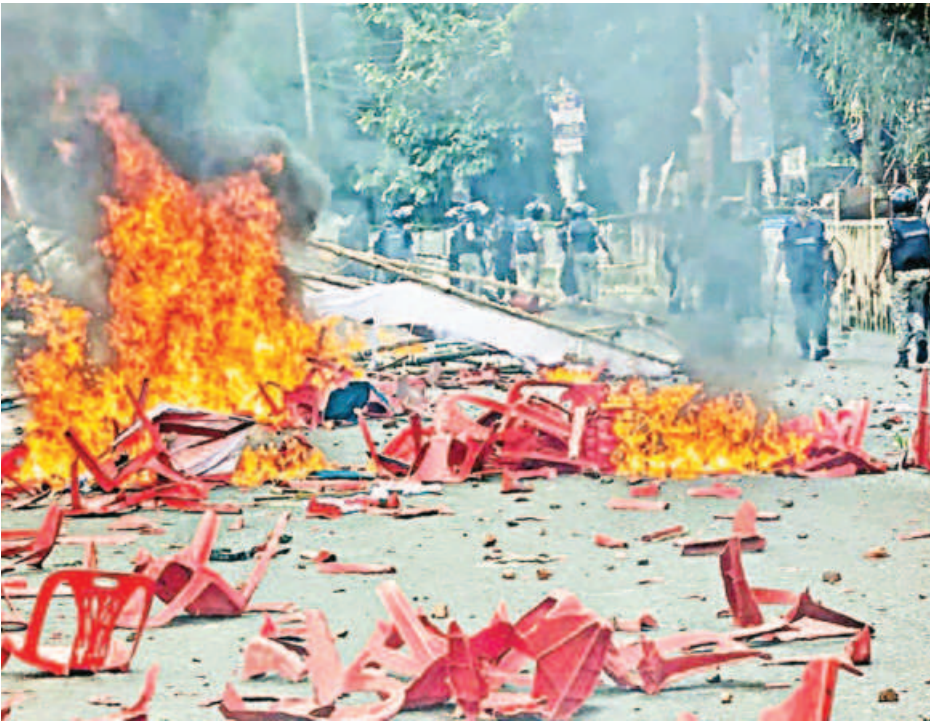
SCENES FROM GOPALGANJ... Plastic chairs burn on a street, left , in Gopalganj town after members of the Awami League and banned Chhatra League attacked the venue of an NCP rally before and after the event yesterday. Afterwards, army personnel patrolled the area in armoured vehicles, top right , while locals were seen rushing an injured man to hospital on a rickshaw-van, bottom right .