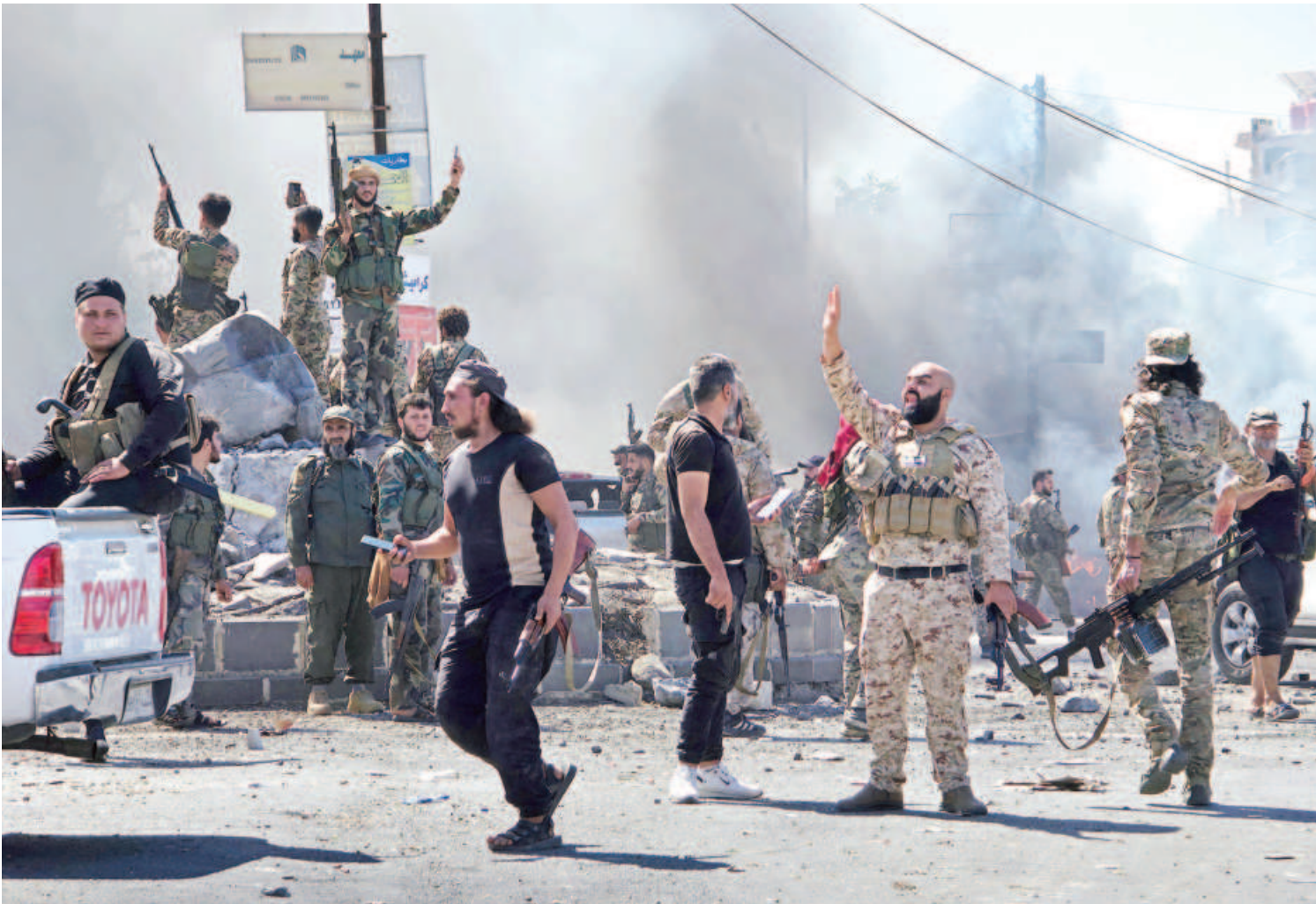
Smoke rises as Syrian security forces sit in the back of a truck, while troops enter the predominantly Druze city of Sweida in southern Syria yesterday, following two days of clashes between Bedouin tribes and Druze fighters.

Spokesman Dmitry Peskov said: “The US president’s statements are very serious. Some of them are addressed personally to President Putin.”