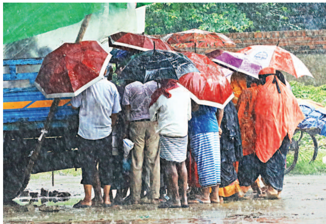
Even amid the pouring rain, some people have no option but to visit a TCB truck for the daily essentials at subsidised prices. The photo was taken in front of the Martyred Intellectuals Memorial in the capital's Rayerbazar area yesterday.