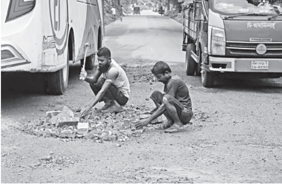
Workers of the Roads and Highways Department repair damaged portions of the Barishal-Kuakata highway. Following heavy rainfall last week, potholes have developed along the route, leaving it in a hazardous state. The photo was taken in Jhalakathi's Jurkathi area yesterday.