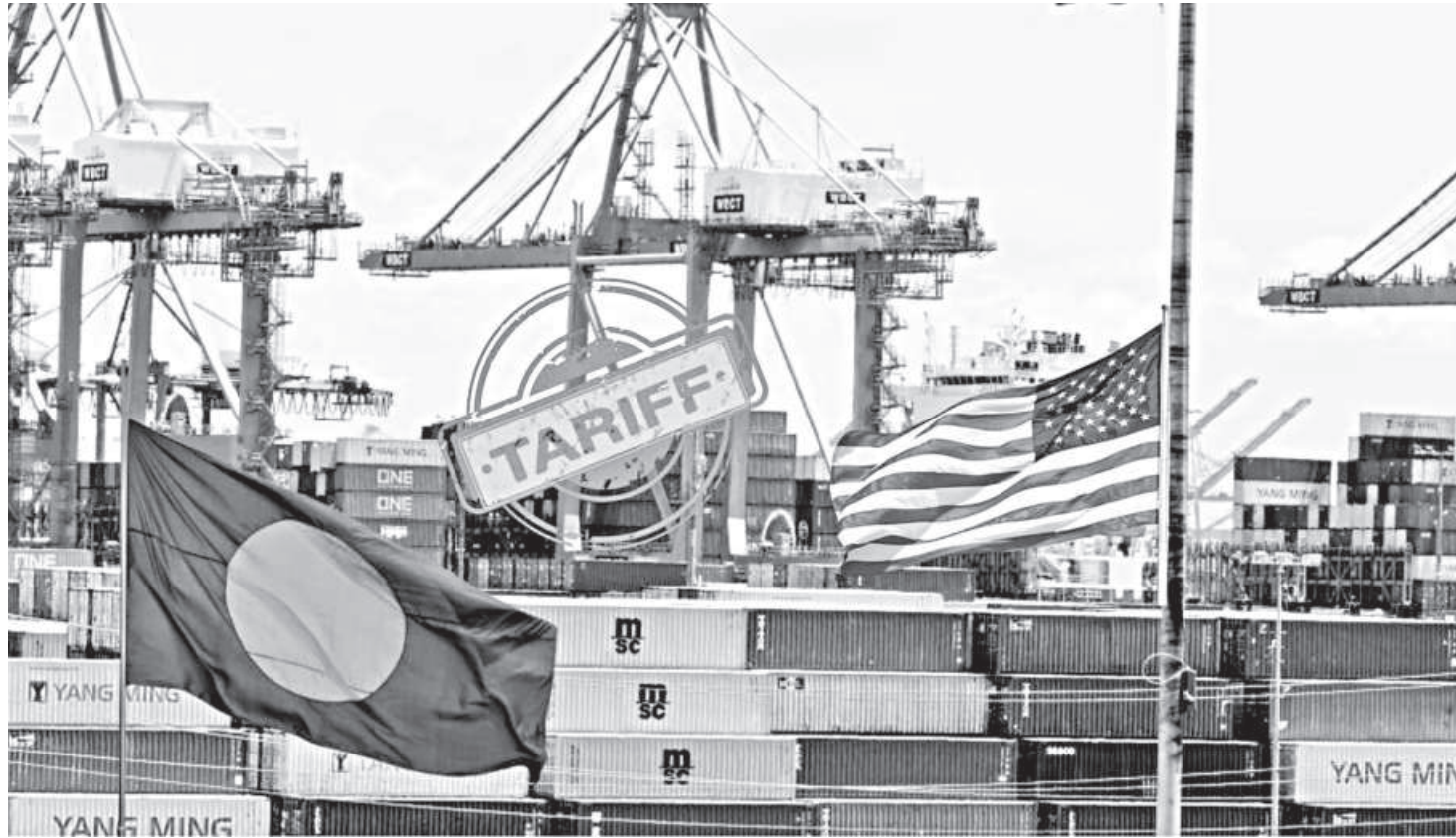
VISUAL: MAHIYA TABASSUM

In Bangladesh, more than 87 percent of the goods exports are RMG, and about 1,821 manufacturing units export these goods. It is a major source of foreign exchange earnings for the country. Bangladesh has been earning more than $4 billion from RMG exports every year since 2000. The sector employs more than four million workers, 80 percent of whom are women. Therefore, with the announced