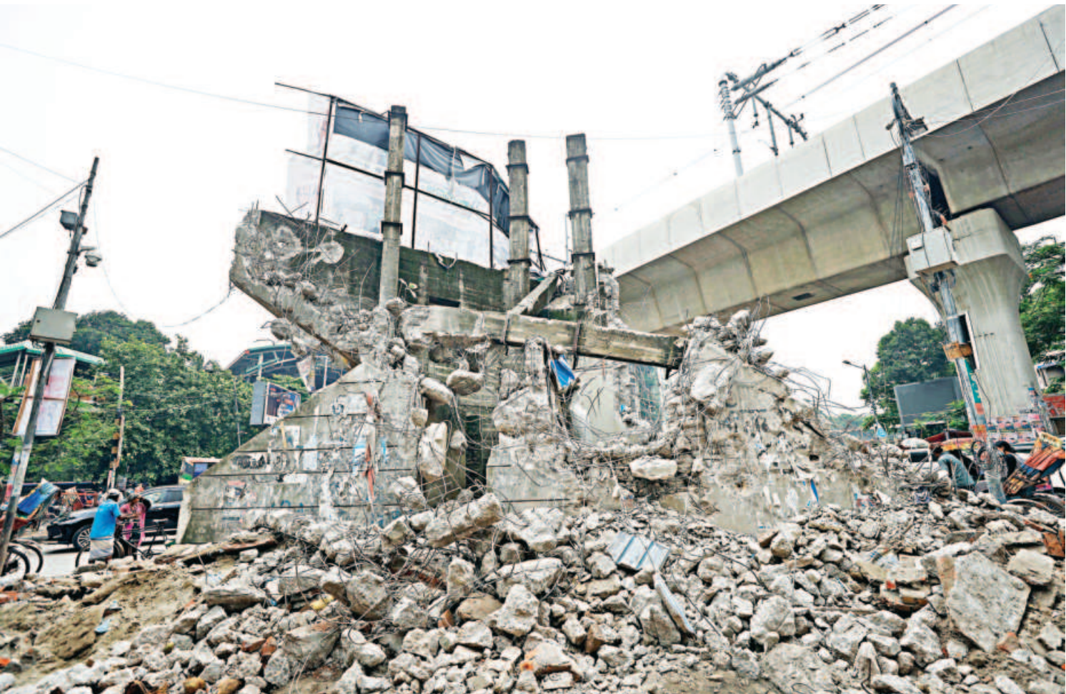
Workers dismantling the “Projonmo Chattar” structure at the Shahbagh intersection in the capital yesterday. The Dhaka South City Corporation began the demolition late Saturday night following instructions from the Ministry of Housing and Public Works. Officials said a new “July Monument” will be built at the site as part of a government plan to construct such monuments in all 64 districts.