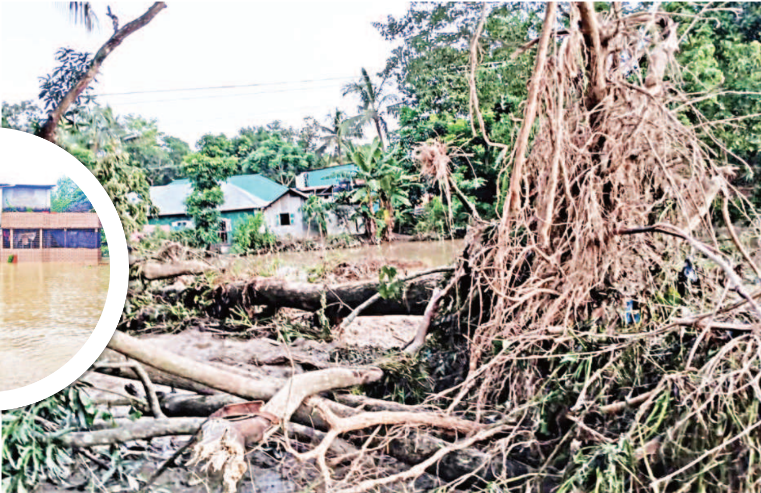
Flood scars remain visible along the Silonia riverbank and in Uttar Daulatpur area of Kulagachhi upazila in Feni, where homes, farmland, and roads were submerged. Although water levels have receded, the aftermath reveals the extent of damage and suffering endured by locals. The photos were taken recently.