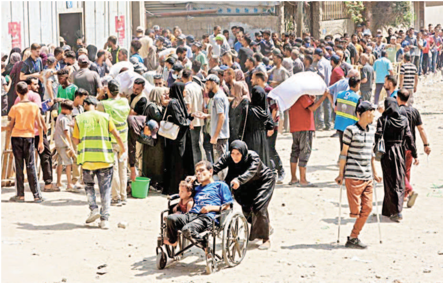
A Palestinian woman pushes a man and a child in a wheelchair as people gather to collect bags of flour at a UN World Food Programme (WFP) warehouse on Al-Jalaa Street in Gaza City, in the central Gaza Strip, yesterday. Story on page 5.

Saima Wazed Putul, the World Health Organization's (WHO) regional director for the South East Asia Regional Office (SEARO), has been sent on indefinite leave from Friday, according to Health Policy Watch. The action was taken four months after Bangladesh's Anti-Corruption Commission (ACC) filed two cases against Saima Wazed, SEE PAGE 9 COL 5