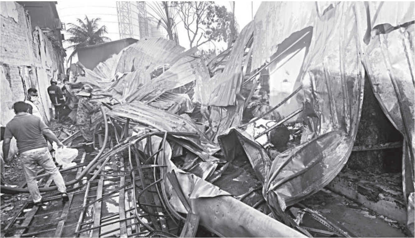
Firefighters douse a flame that broke out at a garment accessories manufacturing factory in the Karnaphuli Export Processing Zone of Chattogram city yesterday afternoon. The fire originated at “Zant Accessories” around 2:30pm. Eight units of the fire service brought the blaze under control around 4:15pm. The cause of the fire and the extent of damage could not be confirmed immediately.