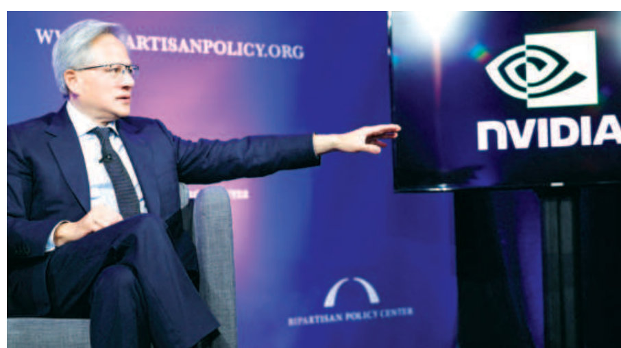
Nvidia founder, President and CEO Jensen Huang speaks about the future of artificial intelligence and its effect on energy consumption and production at the Bipartisan Policy Centre in Washington, DC.