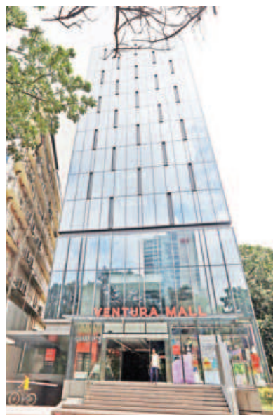
(C), Road 103/95, Gulshan-2), has been constructed beside Pink City. A signboard outside reads, "Rajuk Approved - Shopping Mall - Ready Shops for Rent." One shop is already in operation.

A recent visit to Road 103 revealed that a 13-storey building, Ventura Mall (Plot 14/A, Block CEN