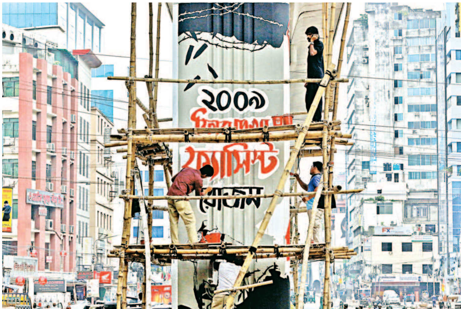
'2009 -- looking back at the fascist regime...' Slogans denouncing the Awami League's 15-year rule being painted on Metro Rail pillars in the capital's Karwan Bazar area yesterday.