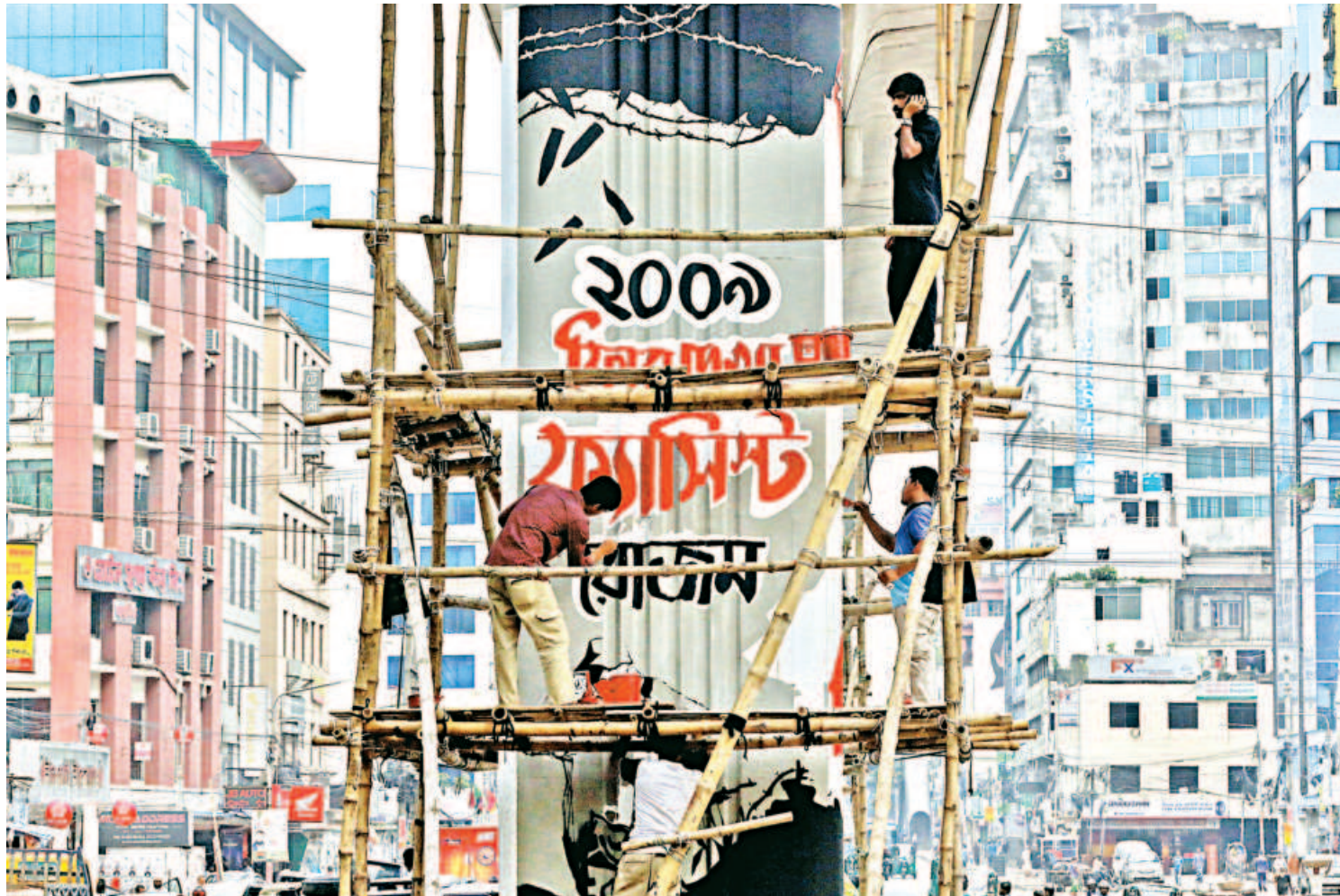
Pillars of the Metro Rail being painted with slogans denouncing the 15-year rule of Awami League. The photo was taken in the capital's Karwan Bazar area yesterday.