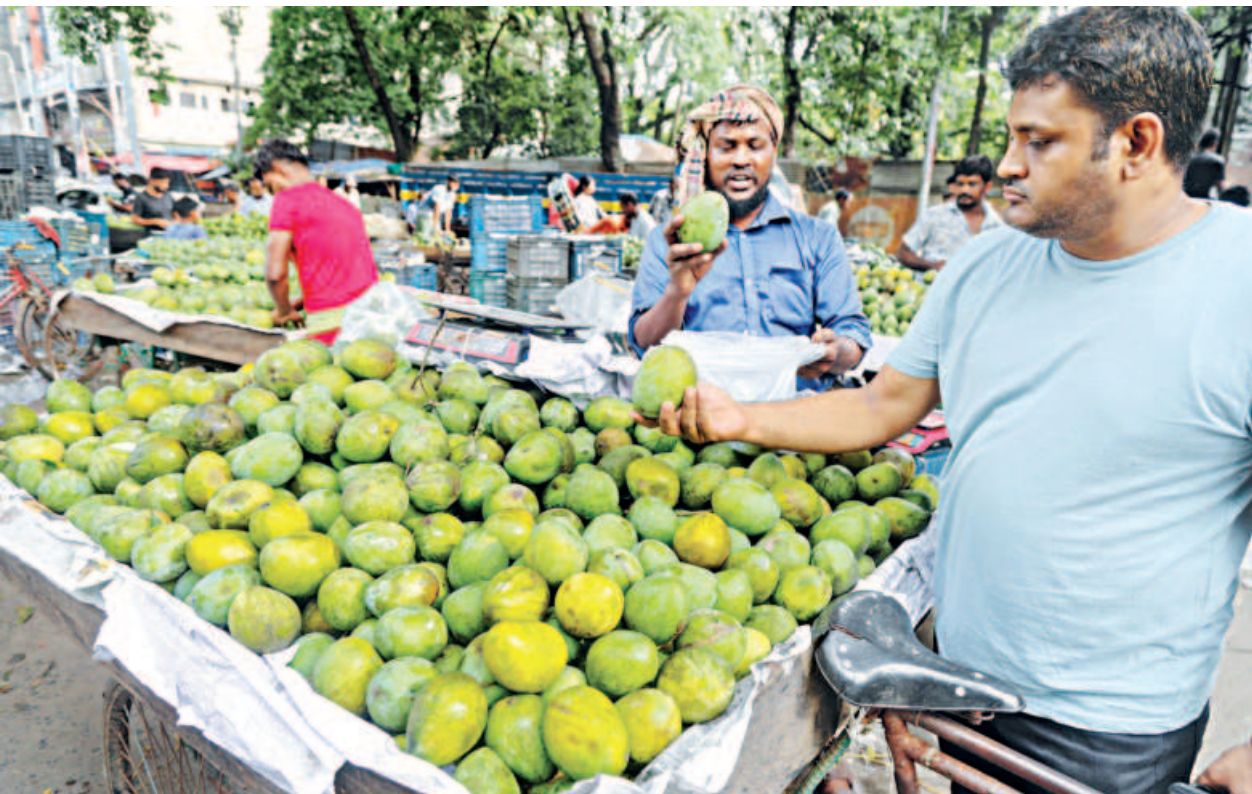
Mango stalls in Chattogram are seeing high footfall as a bumper harvest brings popular varieties like Himsagar, Langra, Amrapali, and Haribhanga to the market. Prices are lower than last year, ranging from Tk 25 to Tk 100 per kg depending on size and variety. The photo was taken in the Kadamtali area of Chattogram recently.