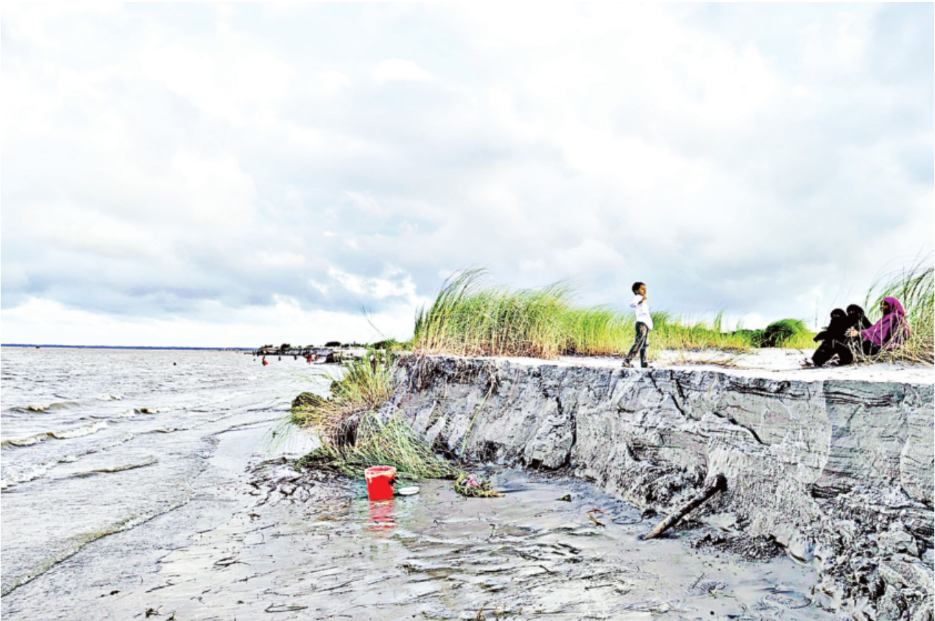
Riverbank erosion along the Meghna in Bhola has intensified due to upstream water pressure and illegal sand extraction, according to locals. Several homes, croplands, and markets have already been lost to the river. In rural Bangladesh, such erosion continues to threaten the lives and livelihoods of communities living near waterbodies. The photo was taken recently.

A Dhaka court yesterday directed the government to issue five gazette notifications summoning 25 individuals, including Sheikh Rehana, sister of the ousted prime minister Sheikh Hasina, to appear before it on July 20 in five cases over alleged irregularities in plot allocation under the Purbachal New Town project. Judge Md Zakir Hossain Galib of the Dhaka Metropolitan Senior Special Judge's Court gave the order after police submitted reports on previously issued arrest warrants, said court sources. The list of accused also includes Hasina's son Sajeeb SEE PAGE 9 COL 5