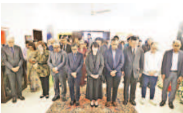
A minute's silence was observed yesterday at the residence of the Italian ambassador in Gulshan.