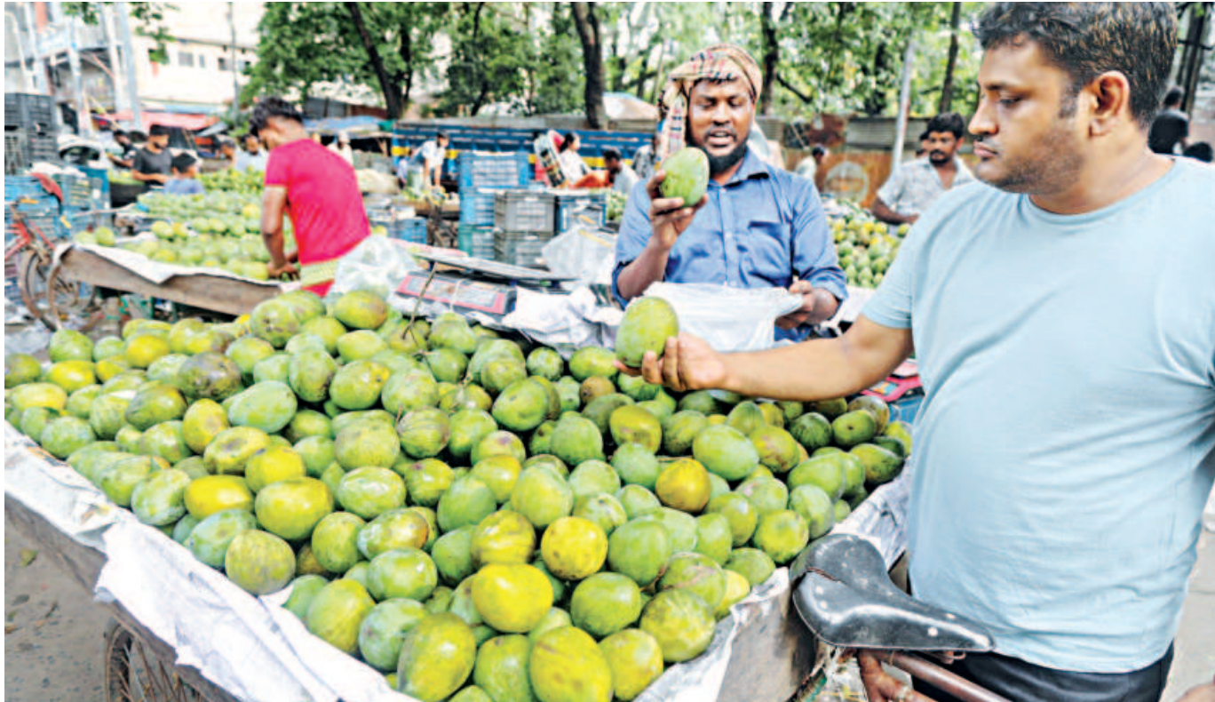
Mango stalls in Chattogram are seeing high footfall as a bumper harvest brings popular varieties like Himsagar, Langra, Amrapali, and Haribhanga to the market. Prices are lower than last year, ranging from Tk 25 to Tk 100 per kg depending on size and variety. The photo was taken in the Kadamtali area of Chattogram recently.