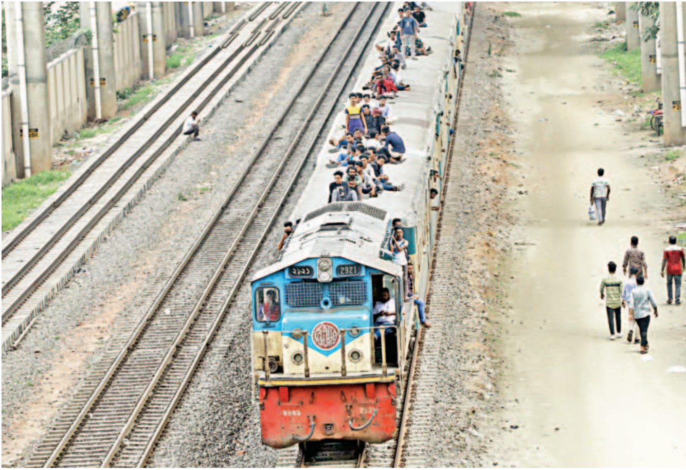
People travel on the roof of a train disregarding rules and risking their lives. Despite incidents of deaths from riding on train roofs, many people continue the practice. The photo was taken yesterday in the capital's Mohakhali area.