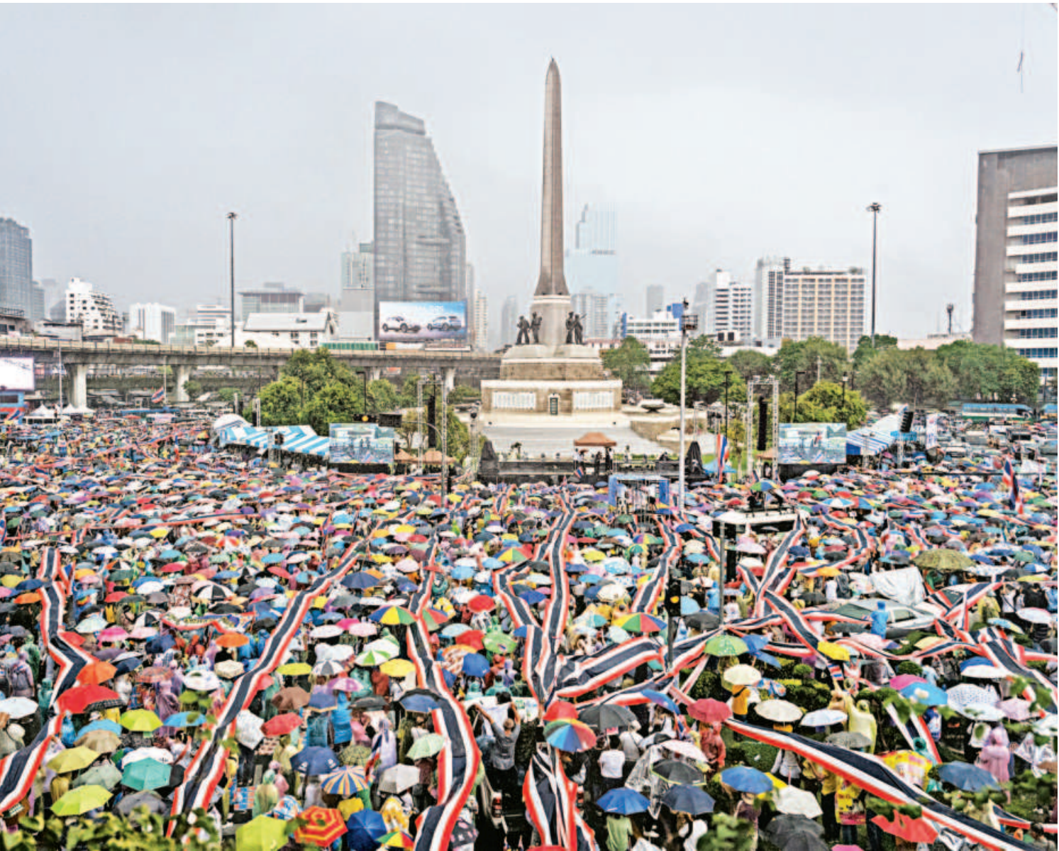
Anti-government protesters rally to demand the removal of Thailand's Prime Minister Paetongtarn Shinawatra from office at Victory Monument in Bangkok yesterday.

"If we don't utilise this window of opportunity and this momentum, it's an opportunity lost amongst many in the near past. We don't want to see that again," said Qatar's foreign ministry spokesman Majed al-Ansari.