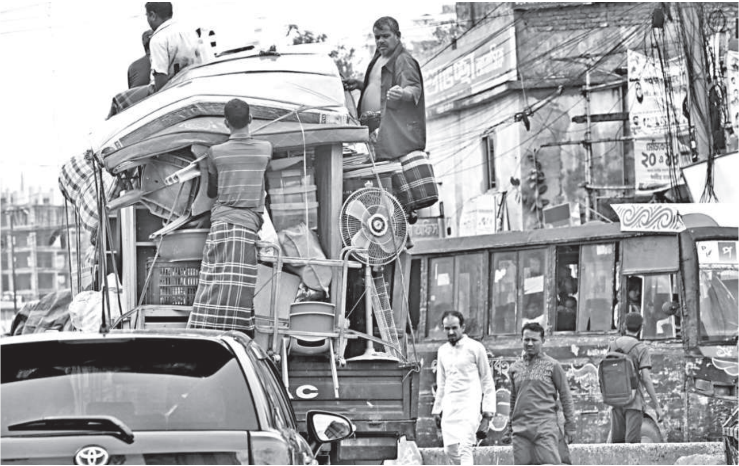
After loading a family's belongings onto the back of their pick-up truck, these movers set off -- not from inside the vehicle, but by dangerously clinging to the piled-up furniture. Their reckless ride puts their lives at serious risk as the truck makes its way to its destination. The photo was taken in the Bosila area of the capital yesterday.

The BGB official said they will be handed over to the police concerned to be transferred to the refugee camps in Cox's Bazar.