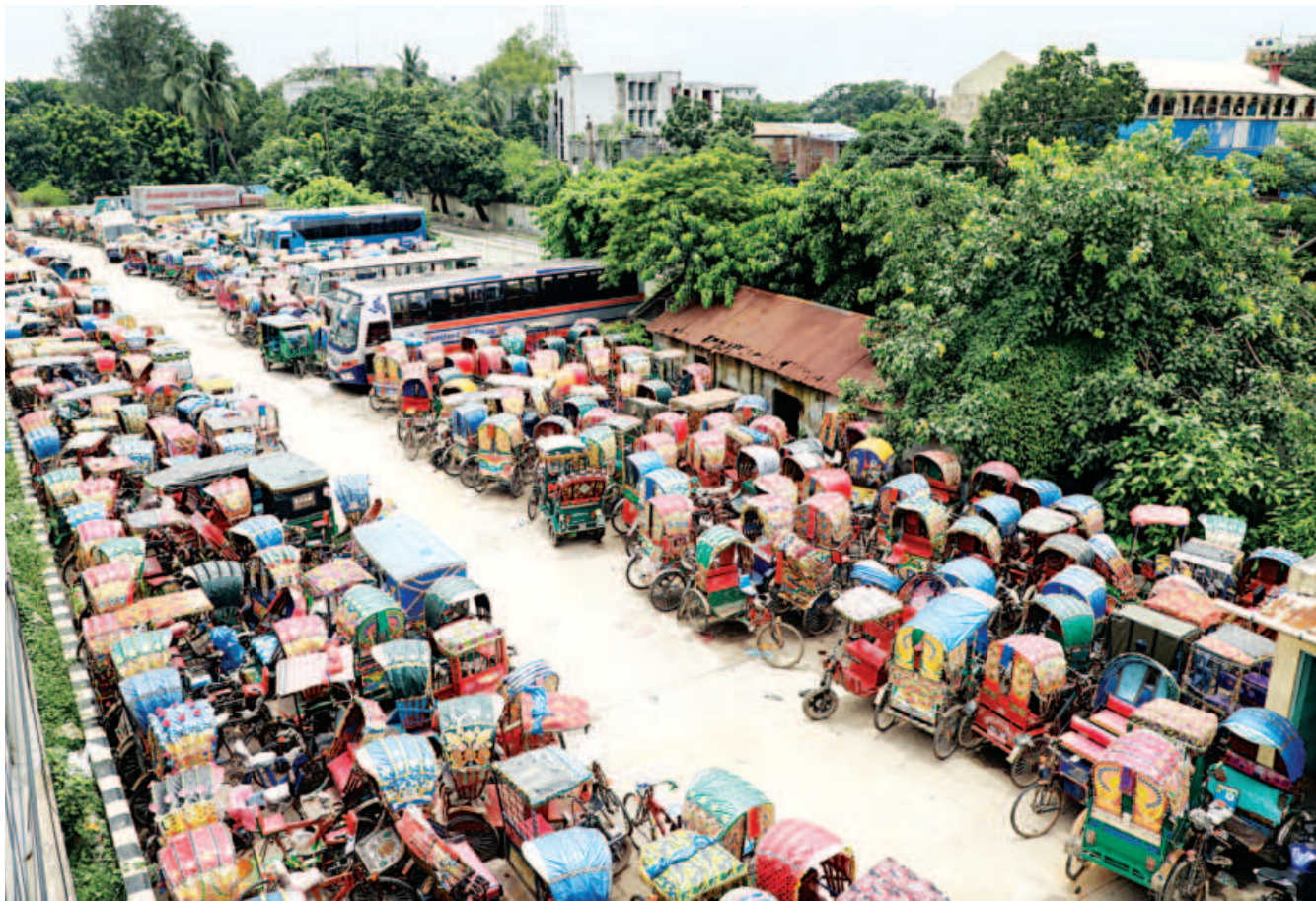
A police impound lot just north of Postogola Bridge in the capital, where most vehicles confiscated for traffic violations are battery-run rickshaws. These vehicles were seized for operating on main roads. Left exposed to the elements for long periods, the conditions of these rickshaws are gradually deteriorating. The photo was taken yesterday.

The IMF has set 33 conditions -- 21 prior and structural benchmarks and 12 performance and indicative targets -- for the next loan instalment. One key requirement is that