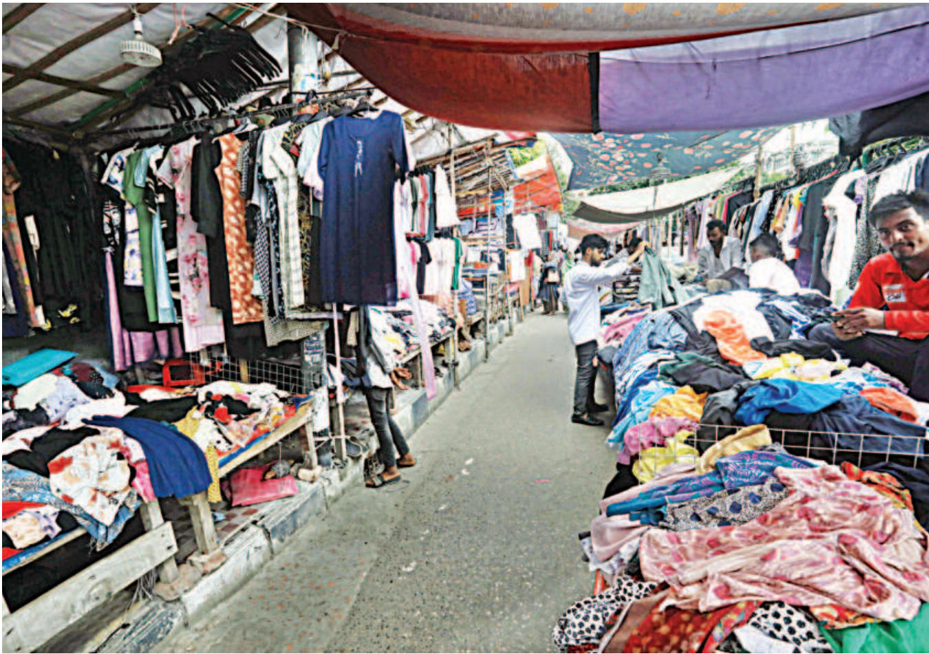
Vendors occupy not just the footpath, a large portion of the street between the BRTA office and Mirpur-10 roundabout, leaving little room for pedestrians and vehicles to pass. The photo was taken yesterday.