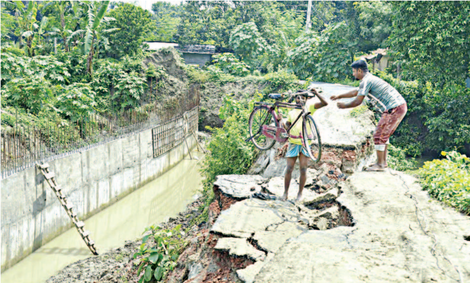
A man hands a bicycle to another across a broken stretch of the road from Pakuria Uttarpara to City Bypass in Rajshahi’s Paba, where large portions have collapsed. Locals say the contractor took no measures to protect the road during the construction of a wall beside it. The photo was taken yesterday.