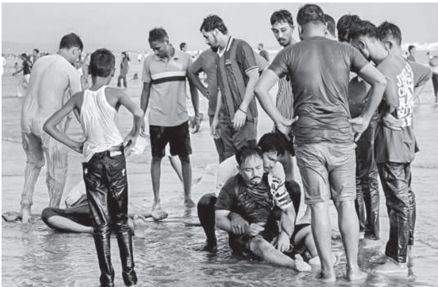
Lifeguards in rescue operation at the beach recently.