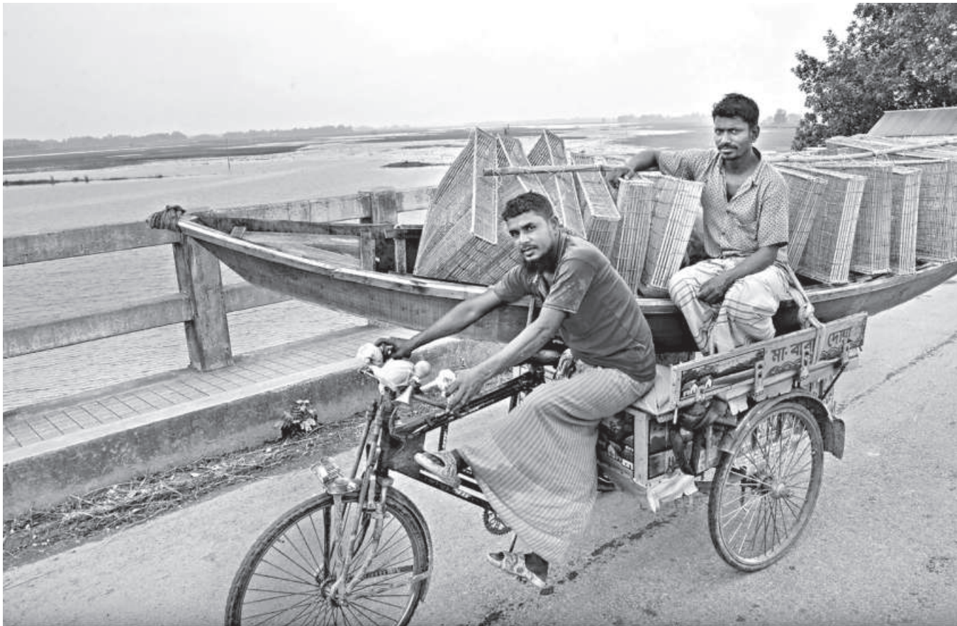
New boats and fishing traps are being transported on a rickshaw-van over the Chalan Beel No-9 bridge in Tarash upazila of Sirajganj, along the Natore-Dhaka highway. With rainwater beginning to fill the beel, local fishermen are preparing for the fishing season by buying boats and traps. The photo was taken recently.