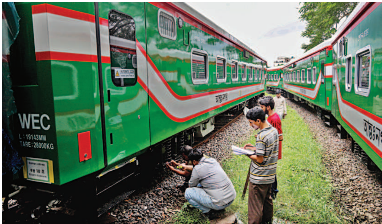
Officials examining a metre gauge rail coach, one of 15 carriages newly imported from South Korea, at a workshop of Bangladesh Railway in Chattogram yesterday.

SEE PAGE 8 COL 2 RELATED STORY ON PAGE 2