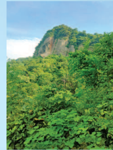
Chittagong Hill Tracts