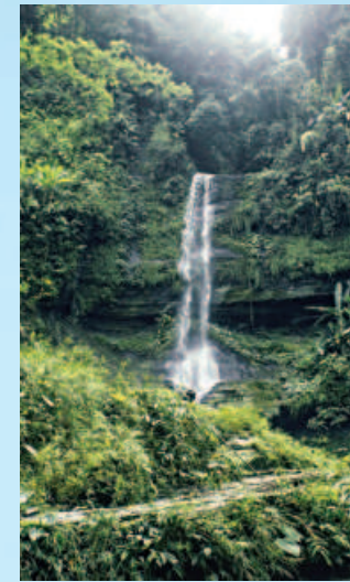
Chittagong Hill Tracts