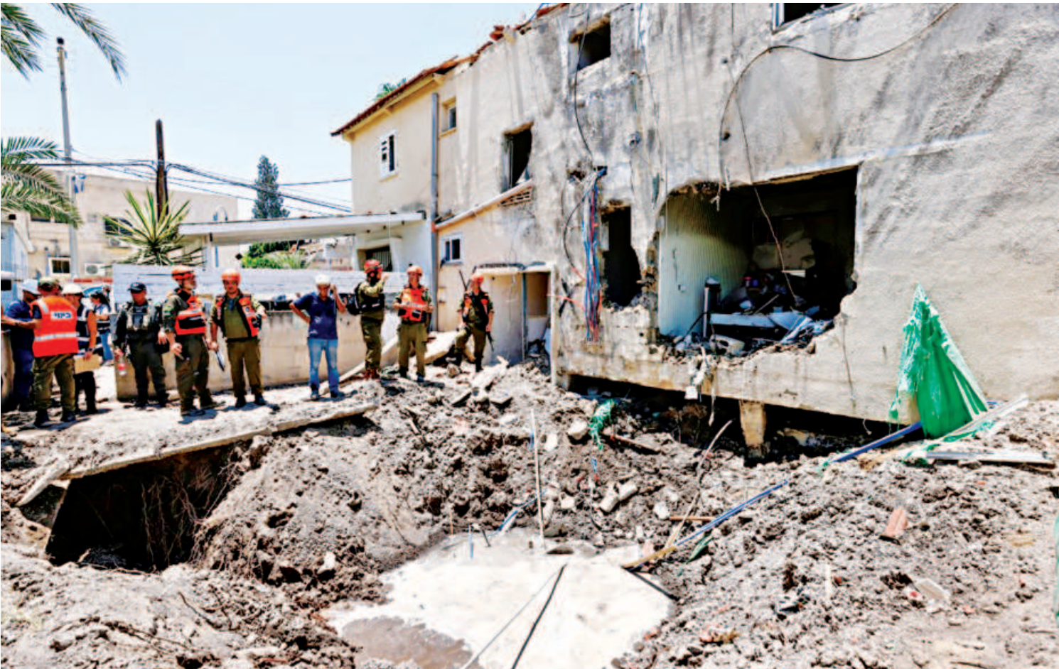
Israeli soldiers and first responders check the damage caused to a building from an Iranian strike in Beit She'an yesterday.

A trenchant critic of Israel’s actions in both Gaza and Iran, Erdogan called for “high-level peace talks” between Tehran and the United States, according to his office, adding that Turkey was ready to play a “facilitator” role to help bring an end to the war.