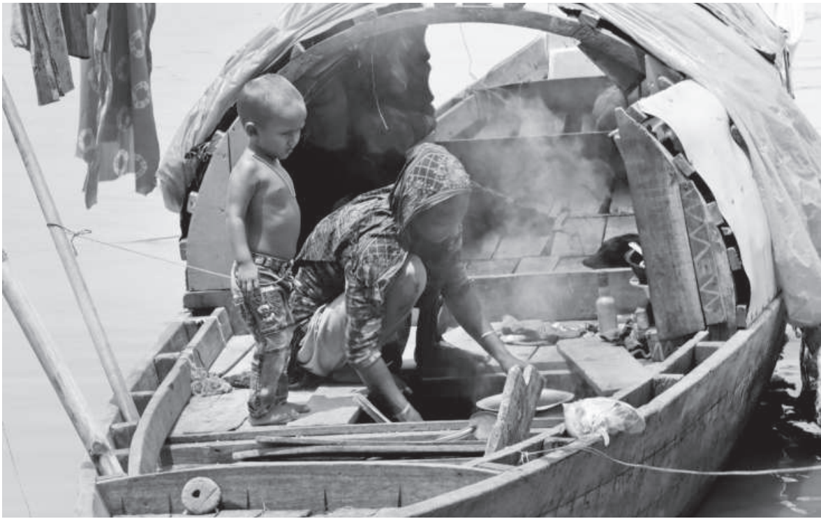
A mother from the floating Bede community living along the banks of the Arial Khan River in Barisal Sadar upazila ties her child with a rope while cooking lunch, fearing he might fall into the river. The photo was taken in the Laharhat Bazar area yesterday.