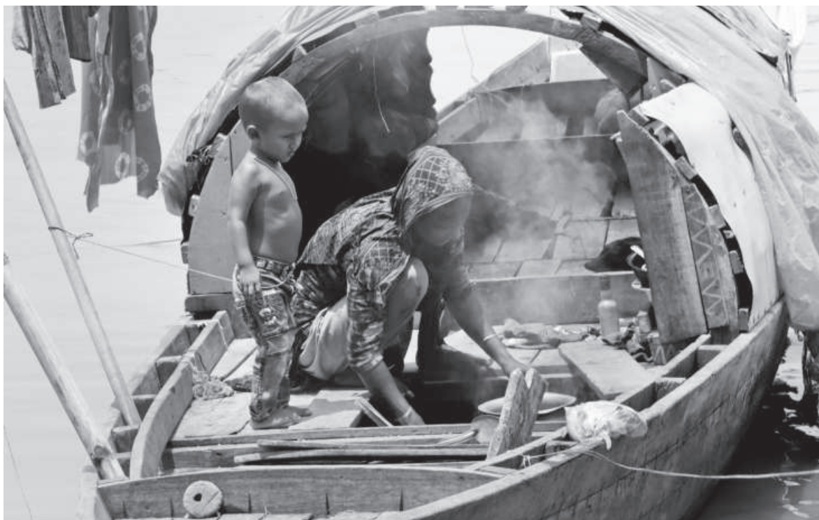
A mother from the floating Bede community living along the banks of the Arial Khan River in Barisal Sadar upazila ties her child with a rope while cooking lunch, fearing he might fall into the river. The photo was taken in the Laharhat Bazar area yesterday.