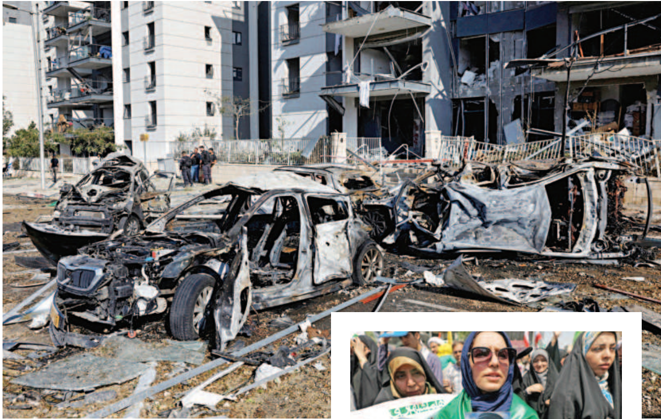
Emergency personnel work next to burnt cars and damaged residential buildings after missile strikes by Iran on Israel’s Be’er Sheva yesterday. Inset: Iranians attend an anti-Israel protest following Friday prayers in Tehran.