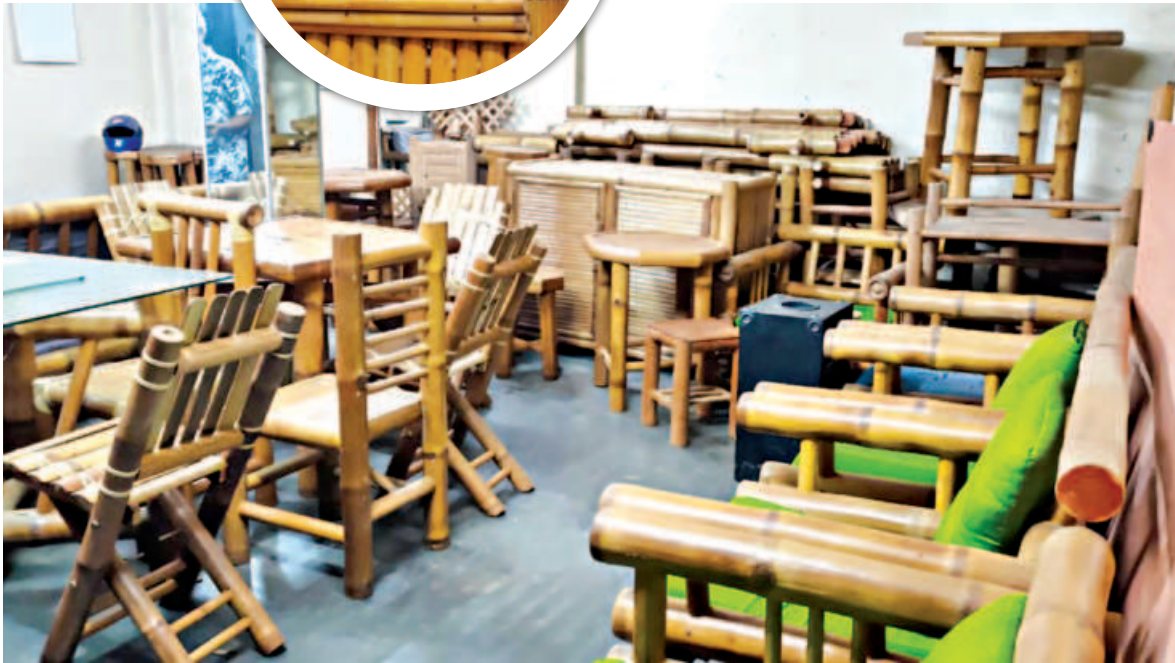
Finely crafted bamboo furniture items line the shop of Amir Hossain Siraj at Baracheg village in Kamalganj upazila, Moulvibazar.