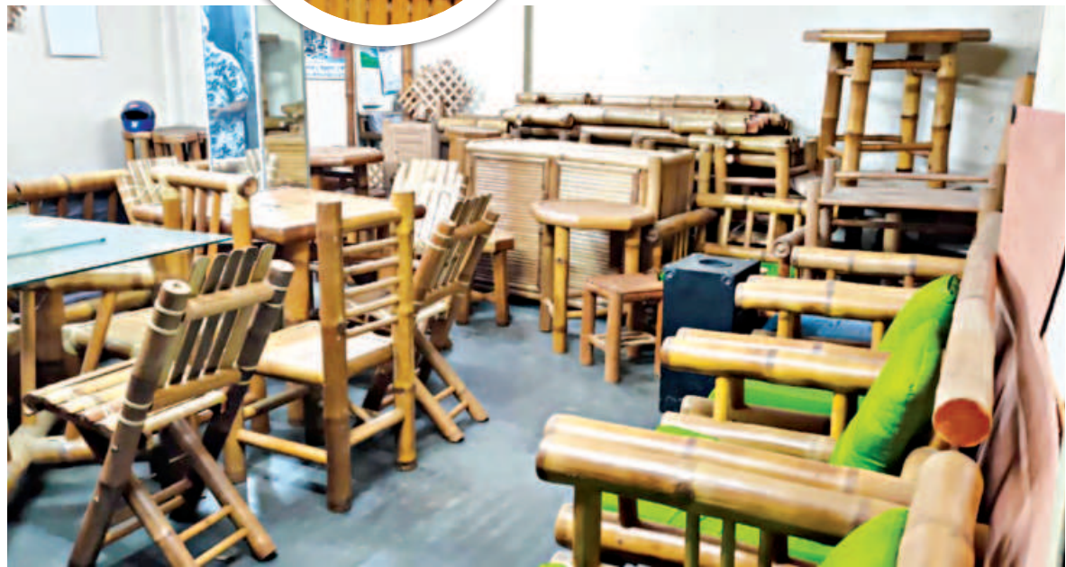
Finely crafted bamboo furniture items line the shop of Amir Hossain Siraj at Baracheg village in Kamalganj upazila, Moulvibazar.