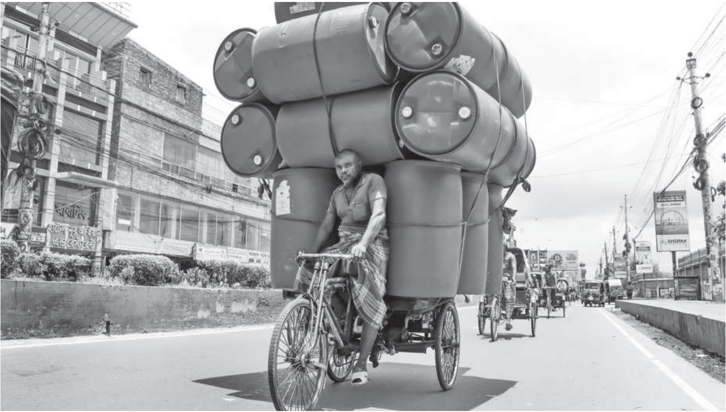
A rickshaw-van driver transports used plastic drums collected from different areas for resale. With the growing popularity of rooftop gardening and similar ventures, demand for these affordable drums is high. Depending on size and quality, each sells for Tk 600-800. The photo was taken opposite the railway station in Khulna city yesterday.