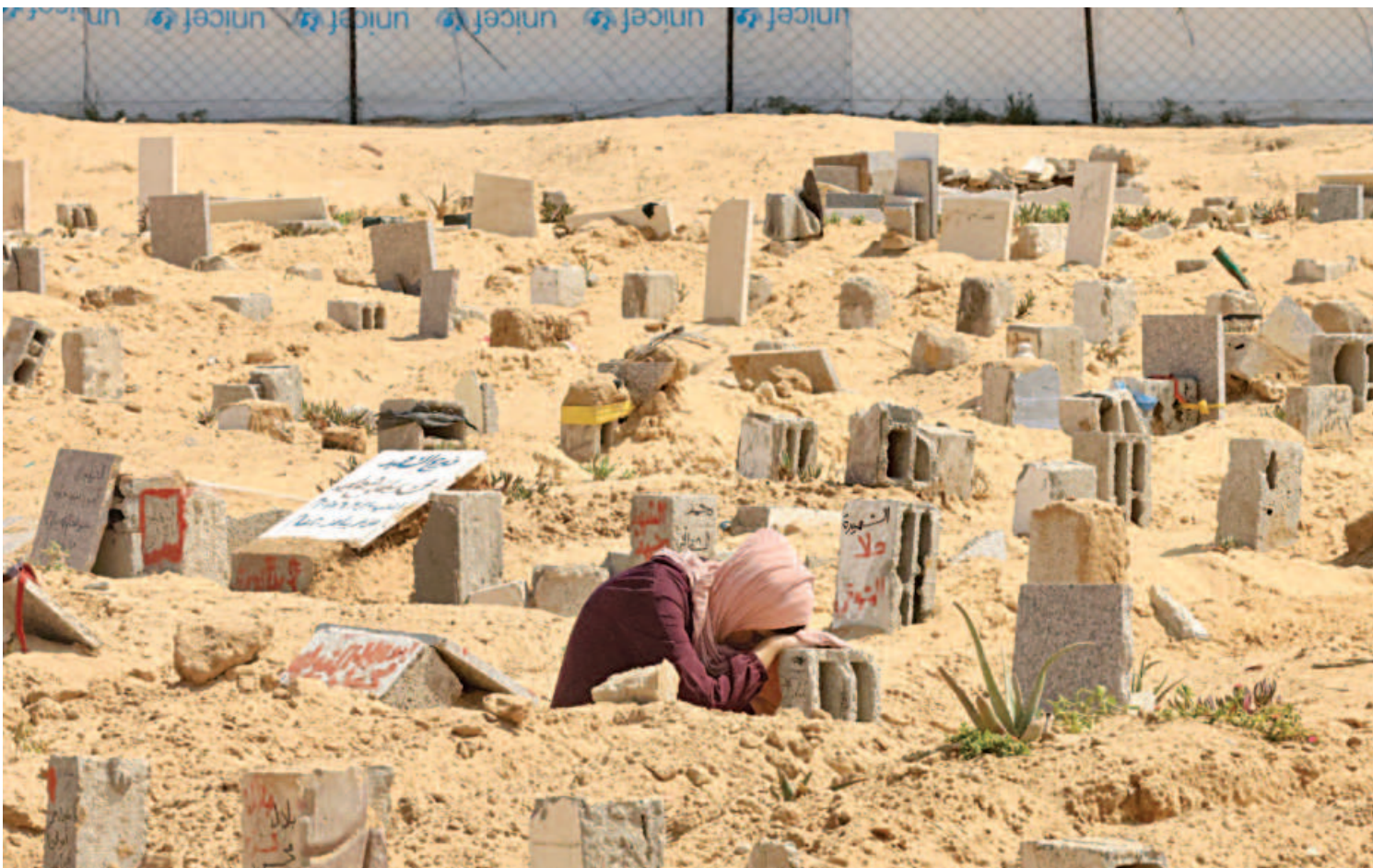
A Palestinian woman mourns at the grave of a relative in Khan Yunis, in the southern Gaza Strip, yesterday.

Since the end of the Cold War, old warheads have generally been dismantled quicker than new ones have been deployed, resulting in a decrease in the overall number of warheads.