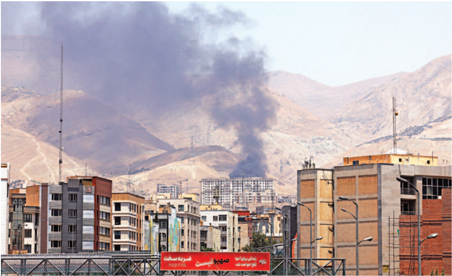
Smoke billows for the second day from the Shahran oil depot, northwest of Tehran, Iran, yesterday. Addressing Iran's parliament, President Masoud Pezeshkian urged citizens to "stand strong against this genocidal criminal aggression with unity and coherence".

Since the end of the Cold War, old warheads have generally been dismantled quicker than new ones have been deployed, resulting in a decrease in the overall number of warheads.