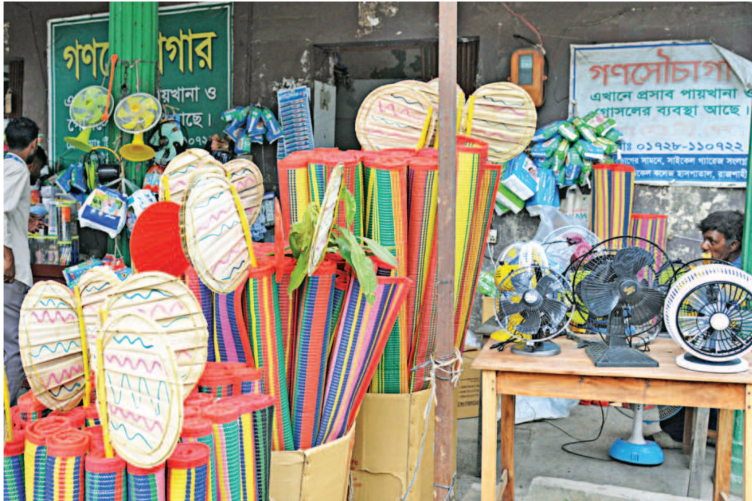
This shop inside the Rajshahi Medical College Hospital campus sells essential items for patients and students. With temperatures soaring across the country once again, its shelves are now dominated by hand fans, portable fans, and stand fans. The photo was taken recently.