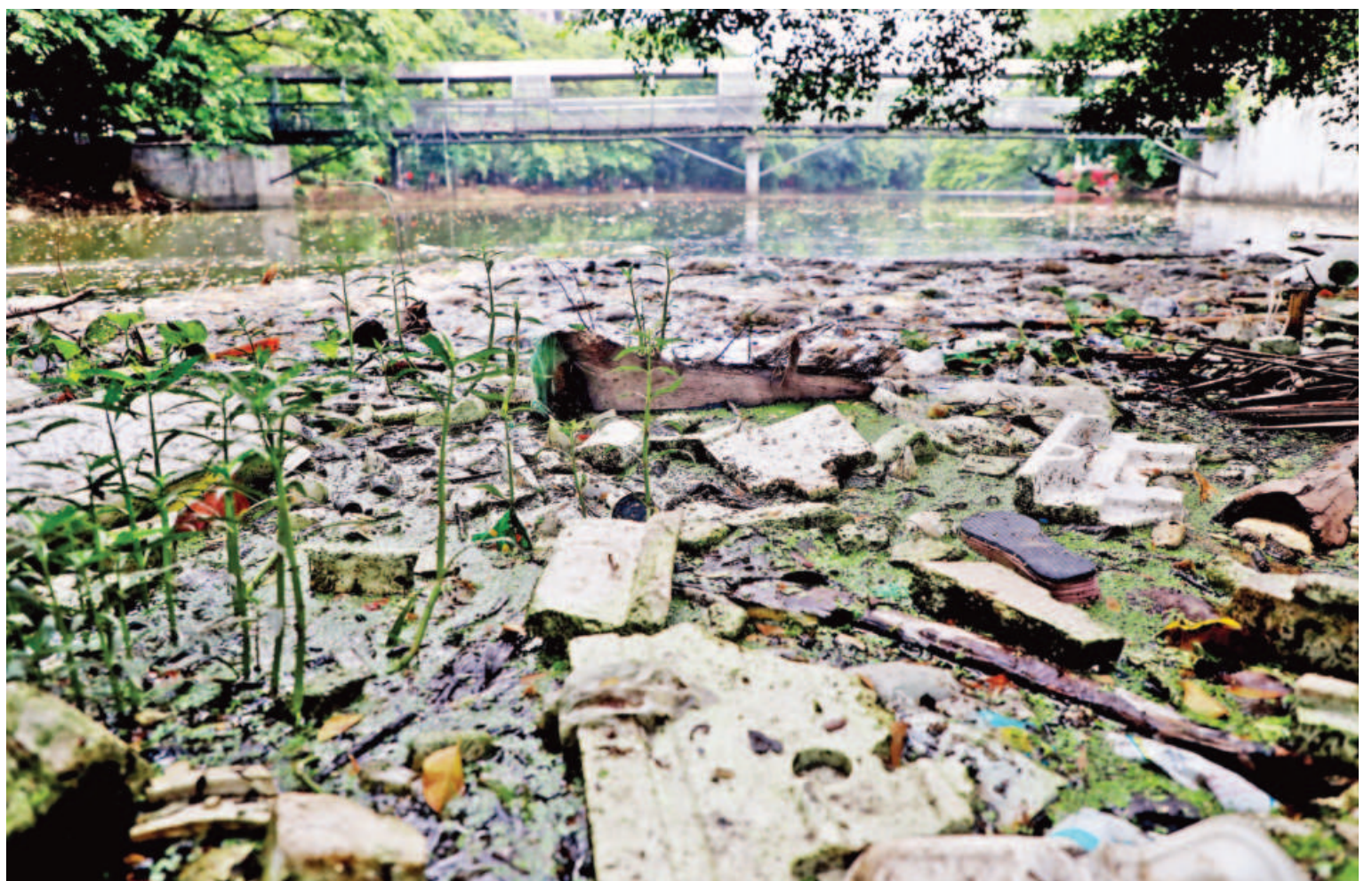
Indiscriminate dumping of waste at this spot near Dhanmondi Lake has become a regular sight. During heavy rains, the accumulated garbage is washed directly into the lake, worsening its pollution. The photo was taken near the Dhanmondi 32 area in the capital yesterday.