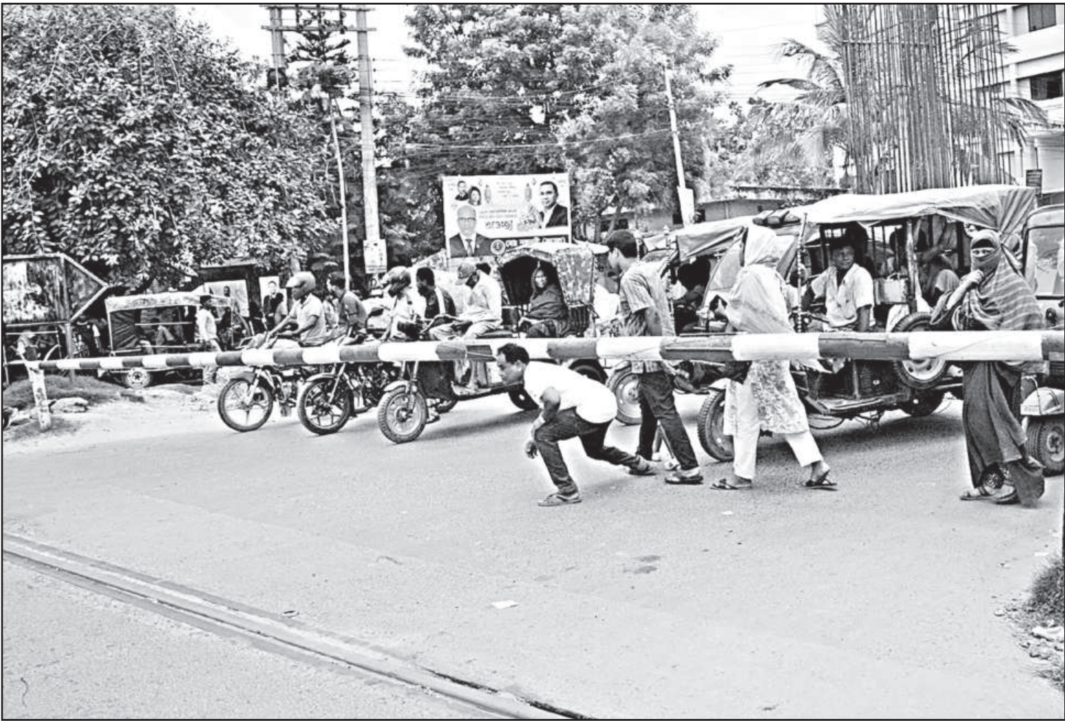
Pedestrians ignore a blockade at a level crossing and cross the road in Rajshahi city despite an approaching train, putting themselves at risk of accident. The photo was taken in the Railgate area yesterday.