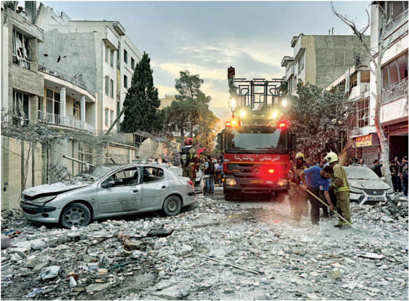
First responders gather outside a building hit by an Israeli strike in Tehran, Iran, yesterday.