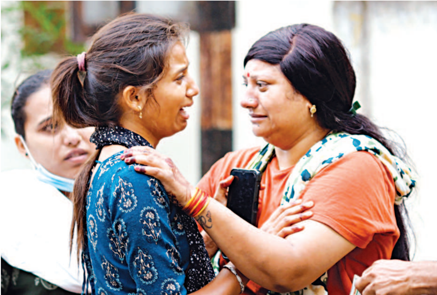
Relatives of victims who died in the Air India Boeing 787-8 Dreamliner crash during take-off mourn as they wait outside the post-mortem room at a hospital in Ahmedabad, India, yesterday.