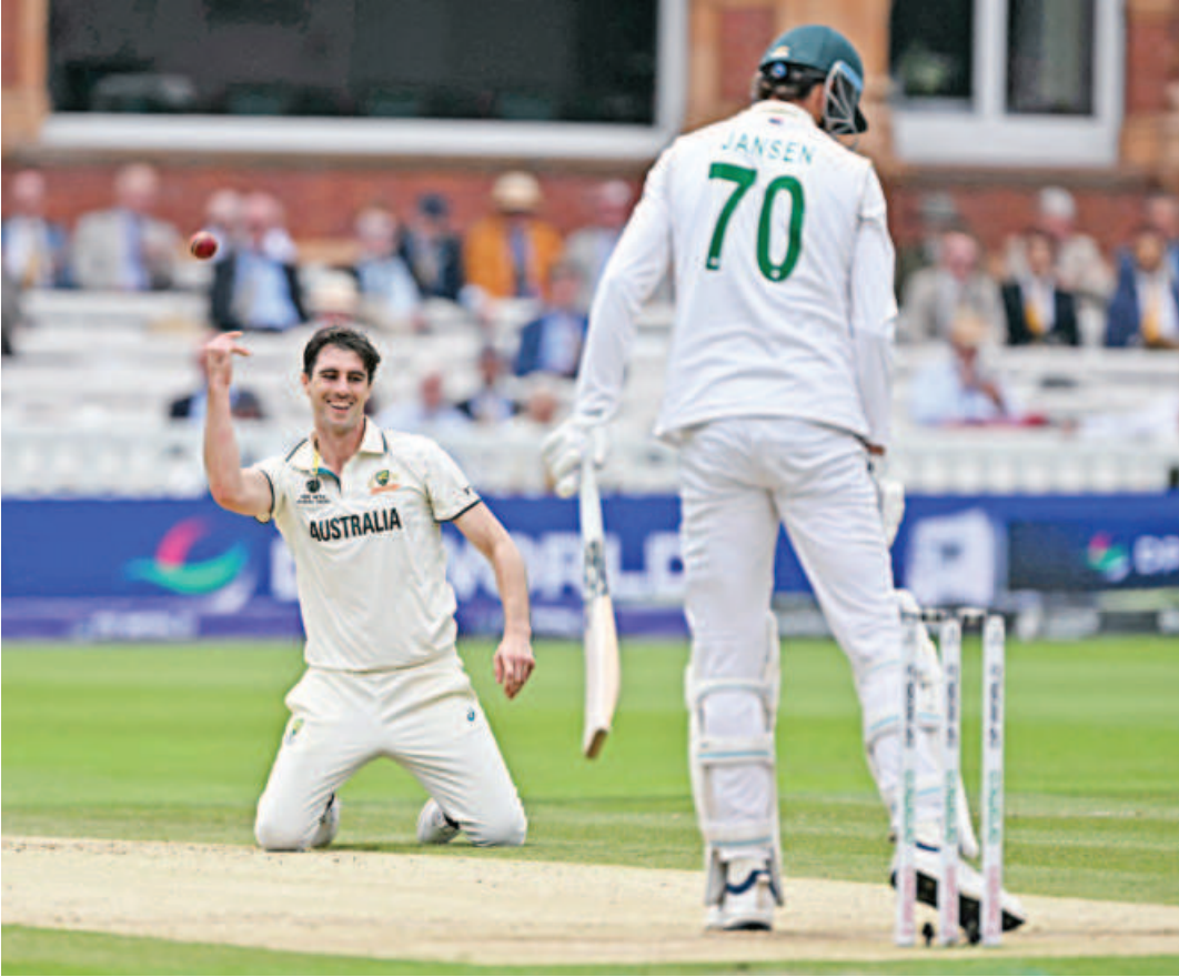
Australia skipper Pat Cummins celebrates after having South Africa all-rounder Marco Jansen caught off his own bowling on Day 2 of the World Test Championship final at Lord’s yesterday. Cummins finished with figures of 6-28, completing his 14th five-wicket haul and first at Lord’s, as he ripped through the lower order to have South Africa bundled out for 138 in reply to Australia’s first-innings total of 212. Cummins also claimed his 300th Test scalp when he removed Kagiso Rabada to wrap up the Proteas’ innings.

Some of the same problems that Ancelotti could not solve – a lack of balance and cohesion in attack – are in Alonso’s in-tray and the Club World Cup is the first chance for him to answer them.