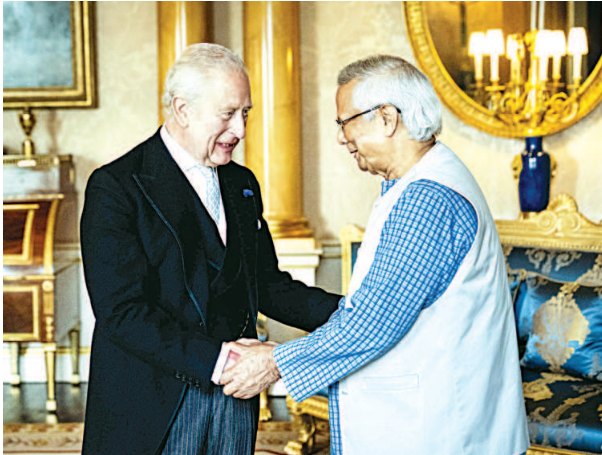
Britain's King Charles III welcomes Muhammad Yunus, Chief Adviser of Bangladesh's Interim Government, for an audience at Buckingham Palace in London yesterday.