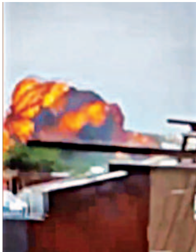
Moments leading to the tragic crash of an Air India flight bound for London at Ahmedabad. The first photo shows the aircraft losing altitude. The second, zoomed in, shows the plane very close to the ground and attempting to climb. The last photo is of the fireball after the crash.