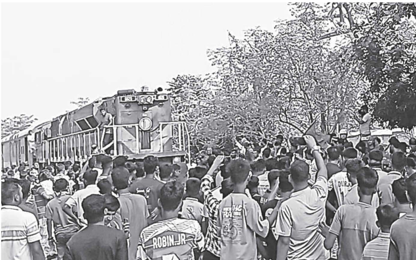
Under the banner "People of Charghat from All Walks of Life," locals staged a blockade yesterday, demanding that intercity trains stop at Nandangachhi Railway Station. The protest began at 6:30am and lasted for two hours, delaying the Sagordari Express to Khulna and the Silk City Express to Dhaka.