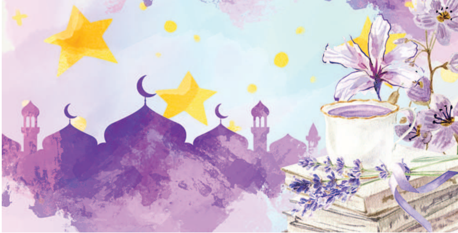
ILLUSTRATION: AMREETA LETHE

This one is for the readers who reserve that one highly-anticipated book to be read later, specifically on Eid. It could be a tear-jerker or a potential five-star read, or it could be a book featuring Muslim characters/Eid itself.