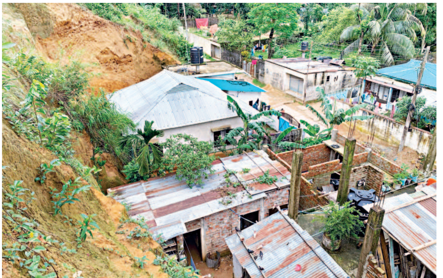
Houses in Jahangirnagar Residential Area No-5 under Tukur Bazar union of Sylhet Sadar upazila have been built at the base of razed hills. With the monsoon underway, residents face a constant threat of landslides. Despite calls for action, local authorities have yet to take preventive measures.