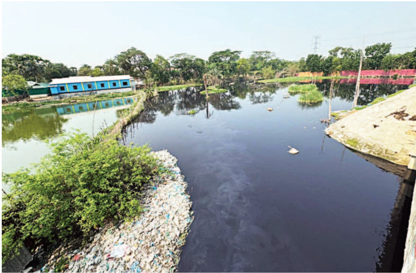
The Labondaho river in Gazipur's Sreepur has withered into a polluted canal now known as Lobolong, its waters darkened by toxic industrial waste. One corner overflows with scrapped polythene bags, while an adjacent enclosed water body remains green in an unsettling contrast. Photo was taken yesterday.