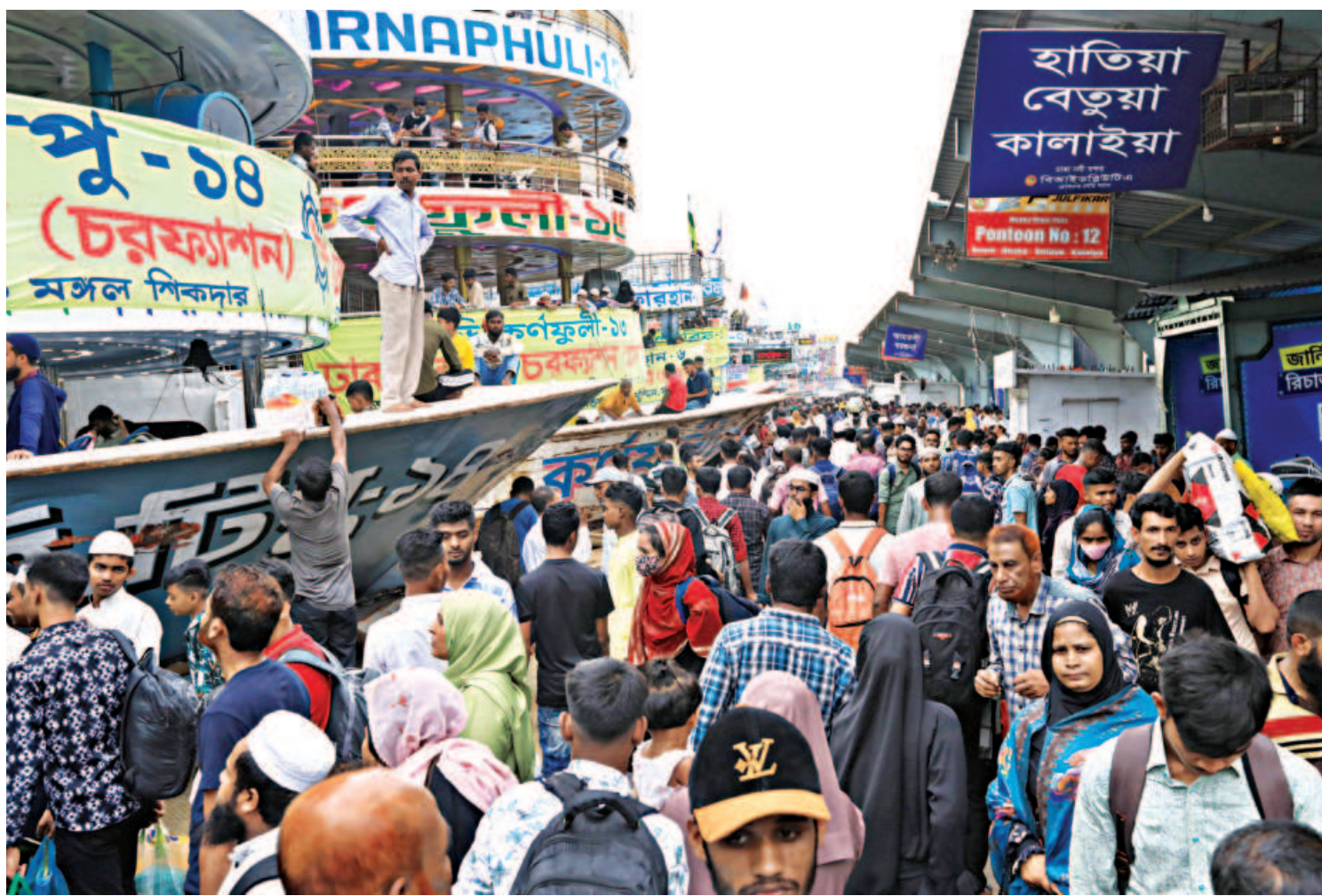
Holiday rush gripped Sadarghat Launch Terminal in Dhaka yesterday as people have begun leaving the capital to celebrate Eid-ul-Azha with their loved ones. Similar scenes were seen at train and bus stations across the city.