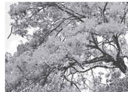
FILE PHOTO: STAR

"We look out for each other," she said. This is something I could never relate to. When I moved away from my maternal home, the houses I lived in, I never knew who my neighbours were. We sometimes met while getting out of our doors, in the garage, maybe