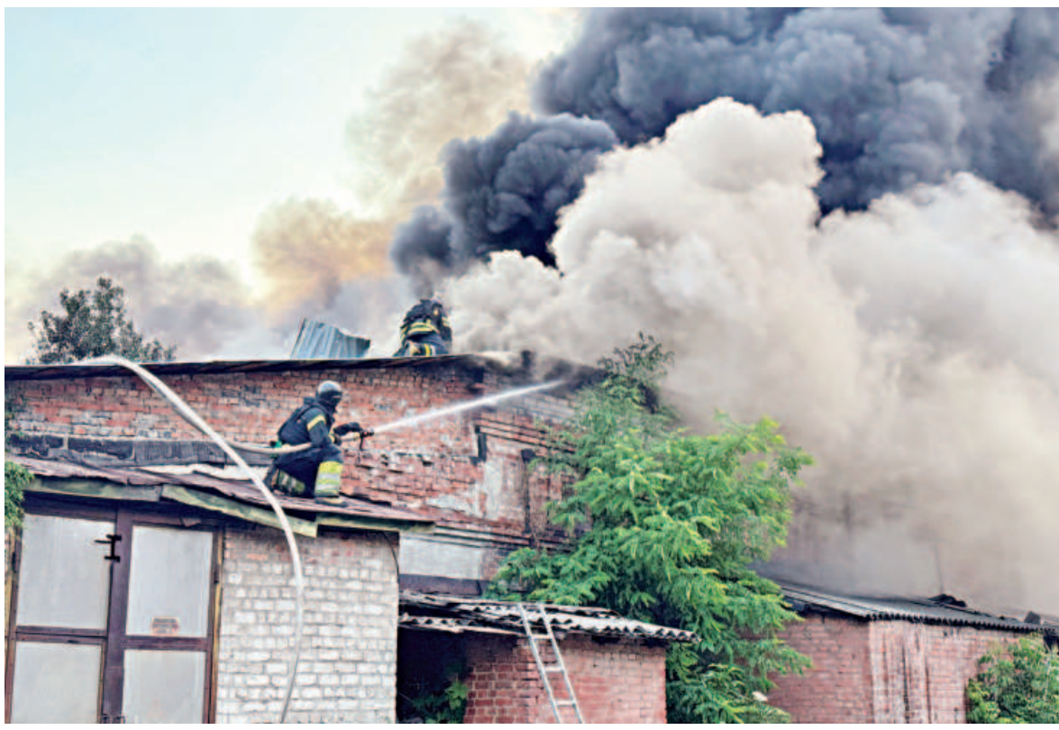
Firefighters work at the site of the Russian drone strike, amid Russia's attack on Ukraine, in Kharkiv, Ukraine yesterday. Three people were killed in the drone attack, officials said.

New Delhi has previously said that terrorism and dialogue cannot go hand in hand.