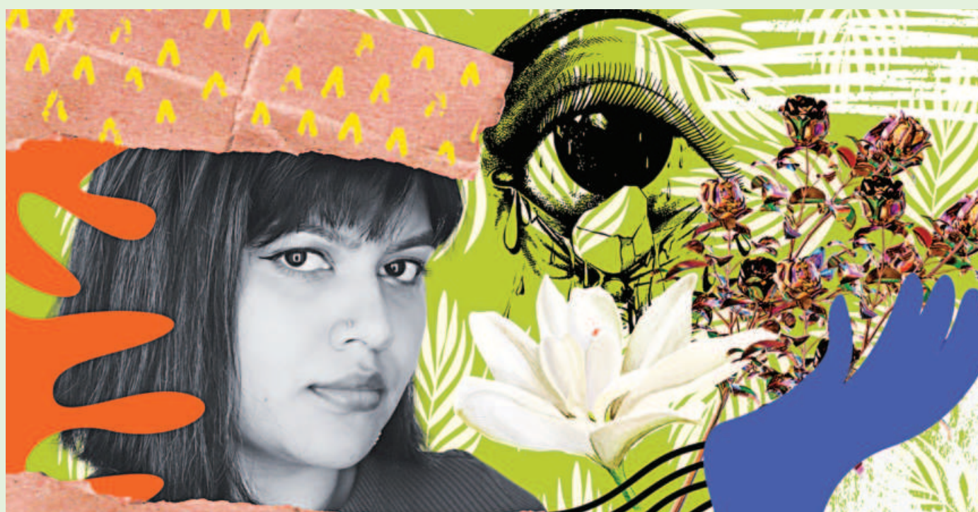
ILLUSTRATION: MAISHA SYEDA

What has it meant to you to have your work recognised by the Commonwealth Foundation? Has this recognition