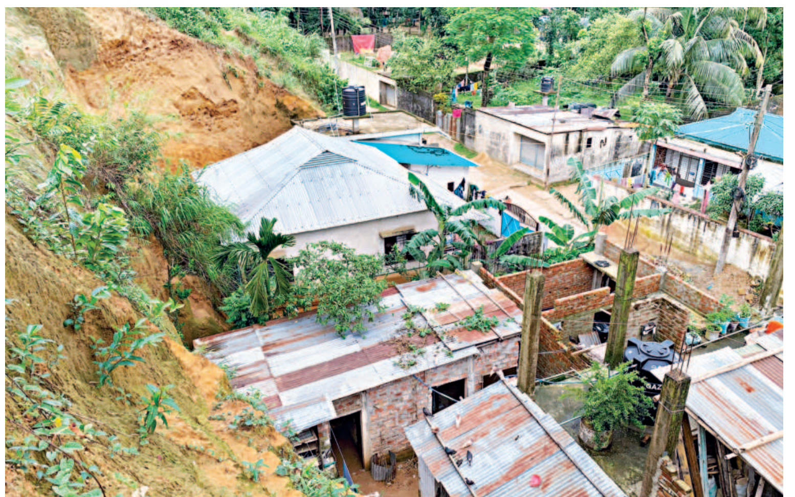
Houses in Jahangirnagar Residential Area No-5 under Tukur Bazar union of Sylhet Sadar upazila have been built at the base of razed hills. With the monsoon underway, residents face a constant threat of landslides. Despite calls for action, local authorities have yet to take preventive measures.