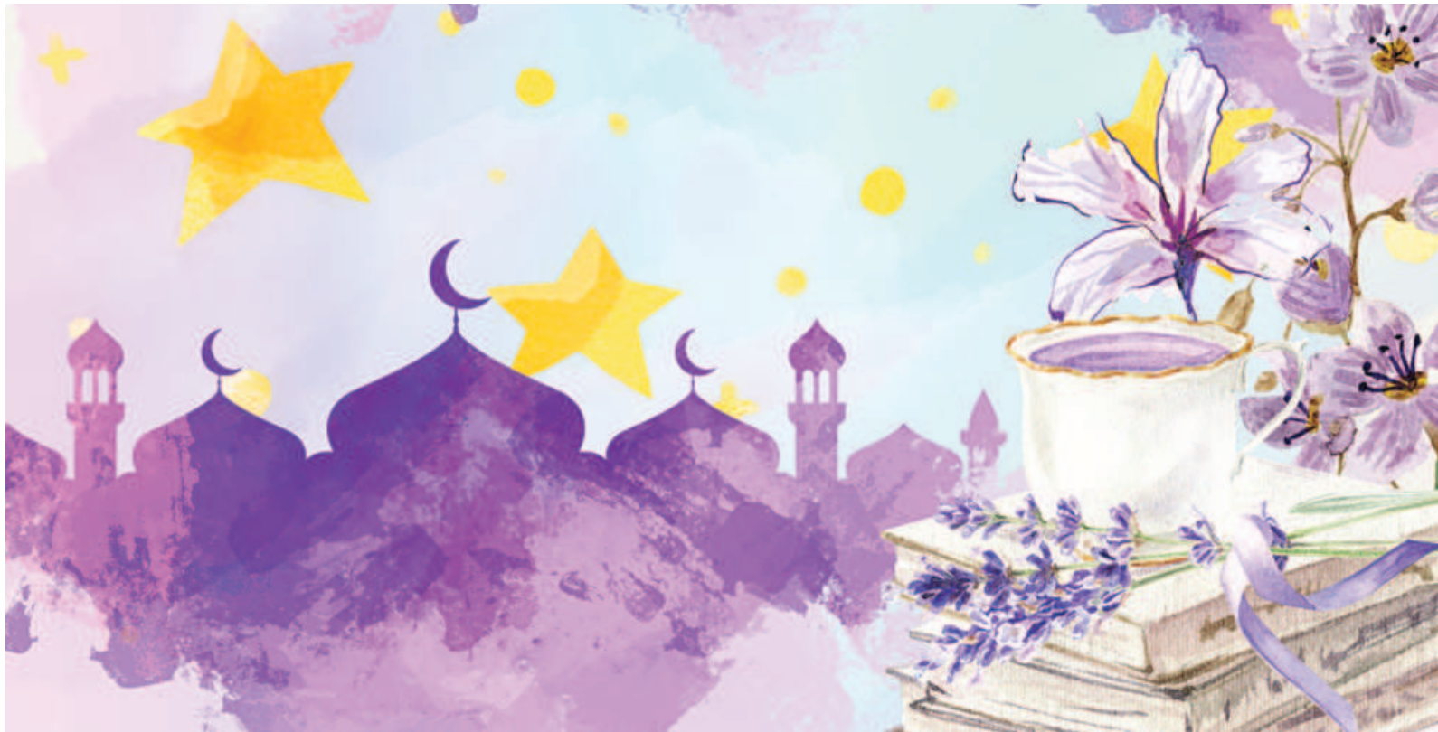
ILLUSTRATION: AMREETA LETHE

This one is for the readers who reserve that one highly-anticipated book to be read later, specifically on Eid. It could be a tear-jerker or a potential five-star read, or it could be a book featuring Muslim characters/Eid itself.