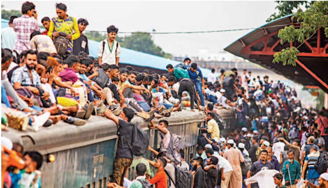
People eager to reunite with their loved ones crowd onto a train, defying the authority's repeated warnings, as they rush to return home for Eid-ul-Azha on the eve of the first day of 10-day government holiday. The photo was taken from the Tongji Railway Station yesterday.

SOURCE: INTER-SECTOR COORDINATION GROUP ON THE ROHINGYA RESPONSE, MAY 8, 2025