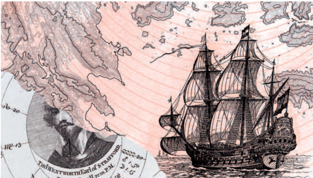
ILLUSTRATION: ABIR HOSSAIN

History isn't only about what happened; it is also about why it happened, who is able to tell the story, and how those narratives shape the world we live in today.