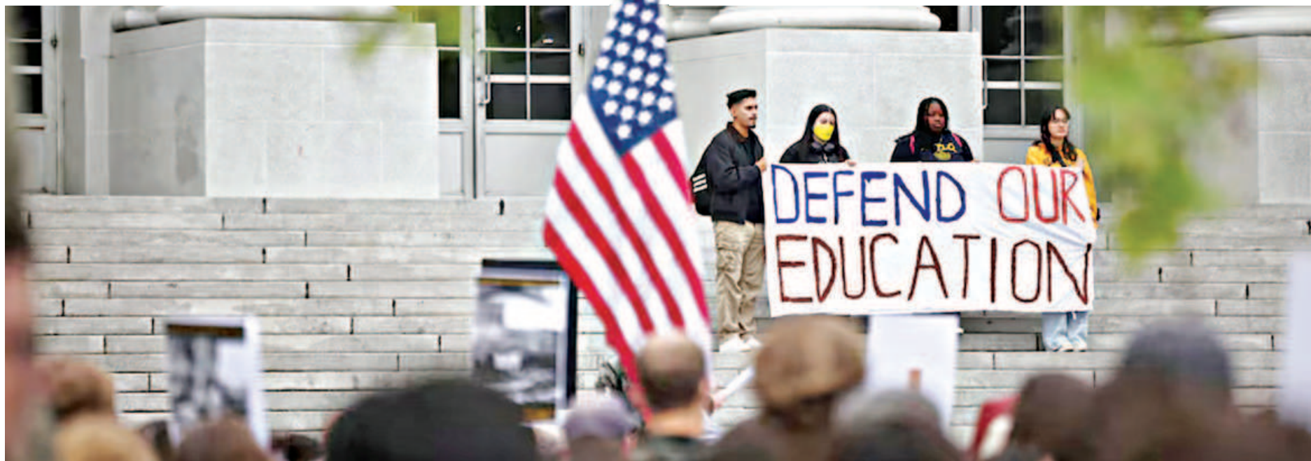
Demonstrators hold a banner during a “Stand Up for Internationals” rally on the campus of Berkeley University in Berkeley, California, April 17, 2025.