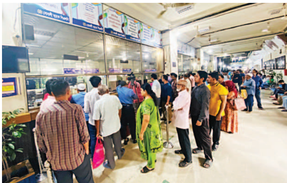
Bank branches across Dhaka witnessed a rush of customers yesterday, the last working day before Eid-ul-Azha holiday, as clients formed long queues to withdraw cash. The photo was taken at Sonali Bank's Motijheel branch.