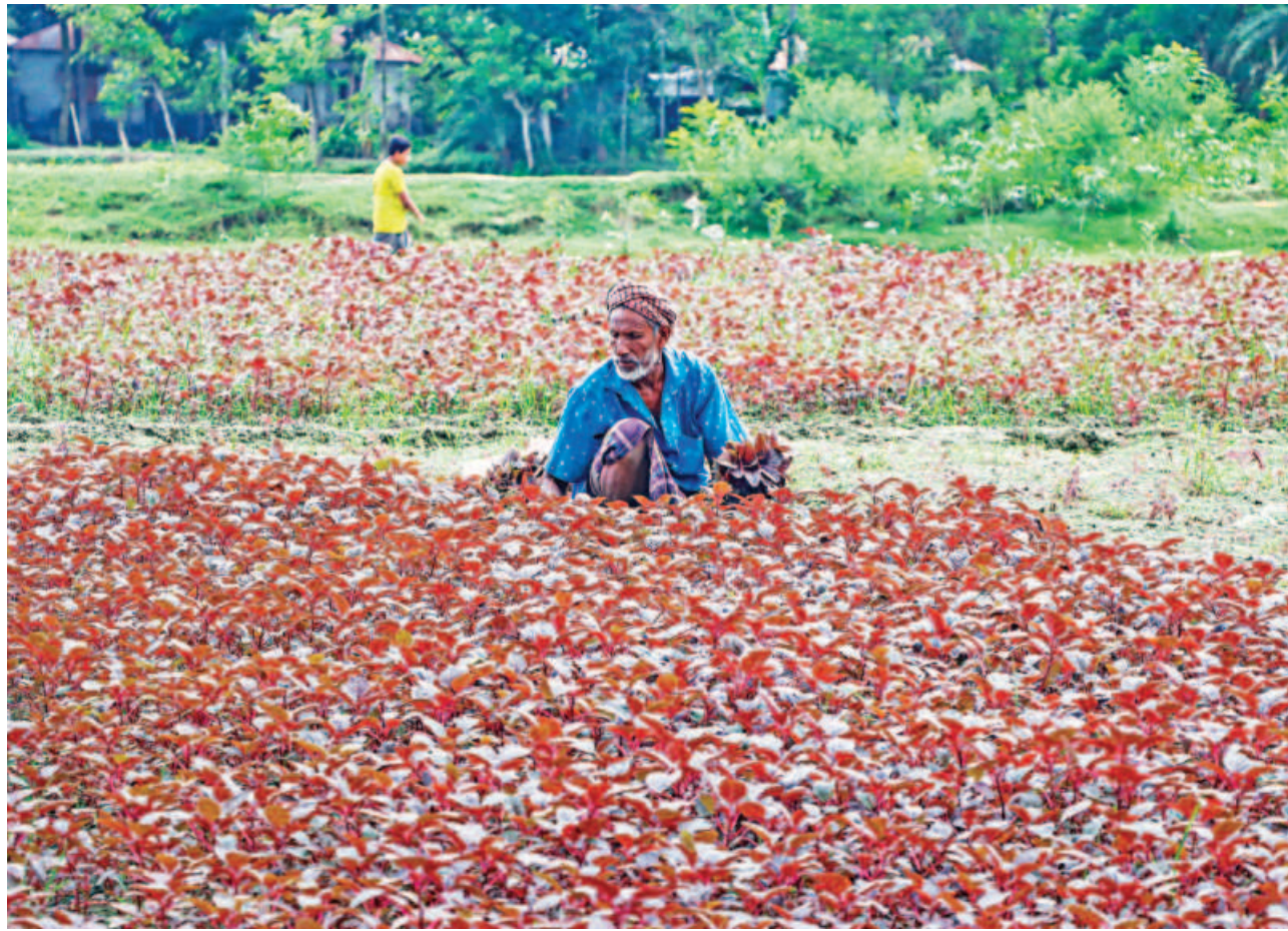
Agricultural output must grow by 4 percent to 5 percent annually to meet the Sustainable Development Goals (SDGs) on food and nutrition security by 2030, said an expert.

Sonargaon Textiles registered the highest gain of the day, surging 9 percent, while Northern Jute Manufacturing Co was the worst performer, falling 7 percent.