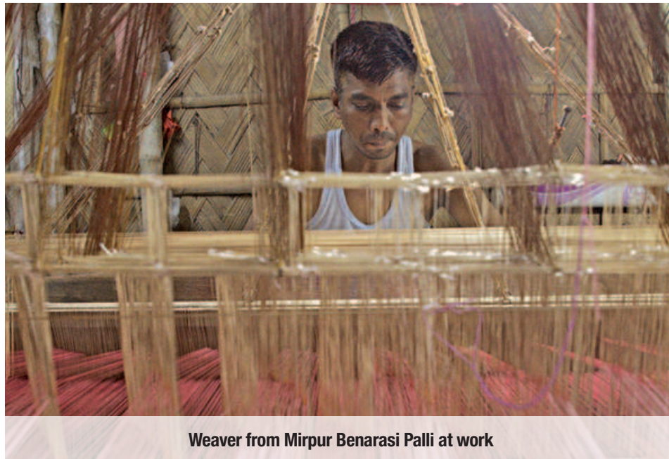
Weaver from Mirpur Benarasi Palli at work